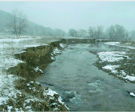
FIGURE 5 Bank erosion along Knapps Creek.