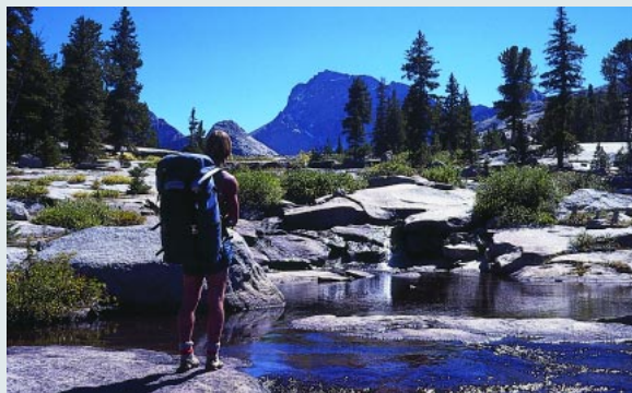
FIGURE 5 Climber approaching Deep Lake, with Temple Peak in the background.