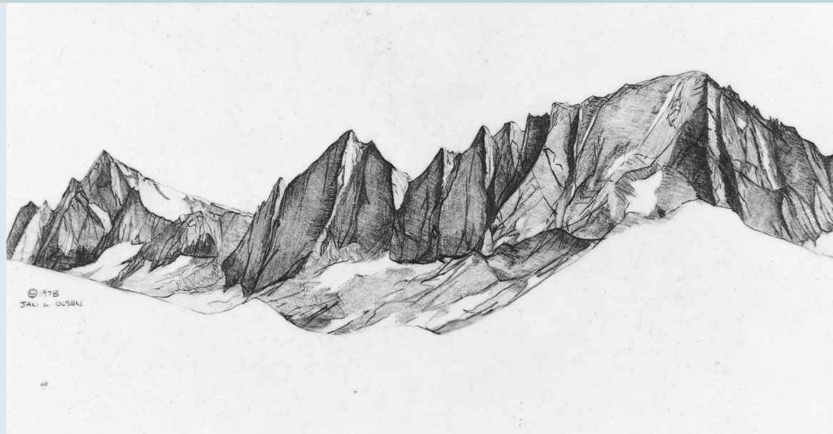
FIGURE 1 Wind River Range, Wyoming, USA; Fremont and Jackson Peaks. Domestic sheep and recreation users compete for access to these mountains. (Ink drawing by Jan Olsen)

struggled to direct the use of America's wildlands, and who compete to influence the federal agency charged with administering this piece of public land (Figure 1). The livestock industry, environmentalists, and the US Forest Service are the players in this battle. And though this particular battleground is shaped by uniquely American institutions and history, the contest itself is one that can be found around the globe.