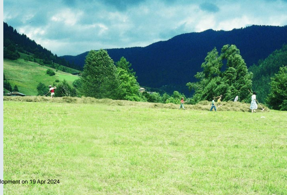
FIGURE 2 Agriculture in Savoy still involves much hard labor. (Photo by Pier Carlo Zingari, 1990)

Savoy is an Alpine department of France where history, culture, and natural resources, including forests, have shaped a valuable and diverse framework for livelihood opportunities. Almost all of Savoy is mountainous, with an average elevation of 1600 m. Forests cover 28.5% (180,000 ha) of its area, higher than the French national average of 25.6%. Forest cover is increasing in Savoy at twice the national average. Coniferous species—Norway spruce ( Picea abies ), silver fir ( Abies alba ),