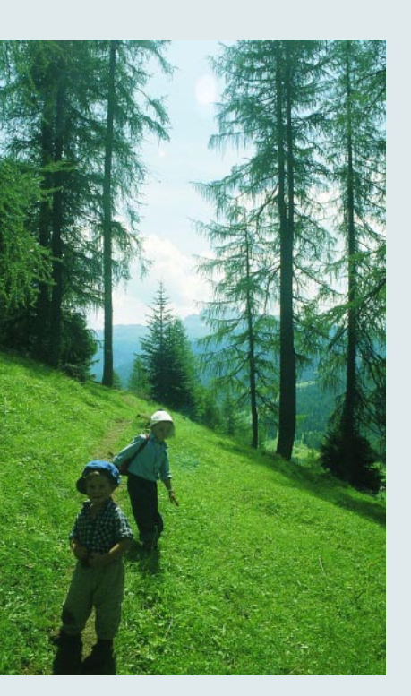
FIGURE 3 Hiking, fishing, game hunting, and collecting mushrooms and berries are all popular activities in the mountain forests of Savoy.

and Scots pine ( Pinus silvestris )—dominate, covering 60% of the forest area. Municipalities own 45% of the forests, particularly those composed of conifers. Private forests are usually of broad-leaved trees and are scattered and small, with an average area of 1.8 ha. The state also owns some forests following the acquisition of lands subject to erosion during the second half of the 19th century.