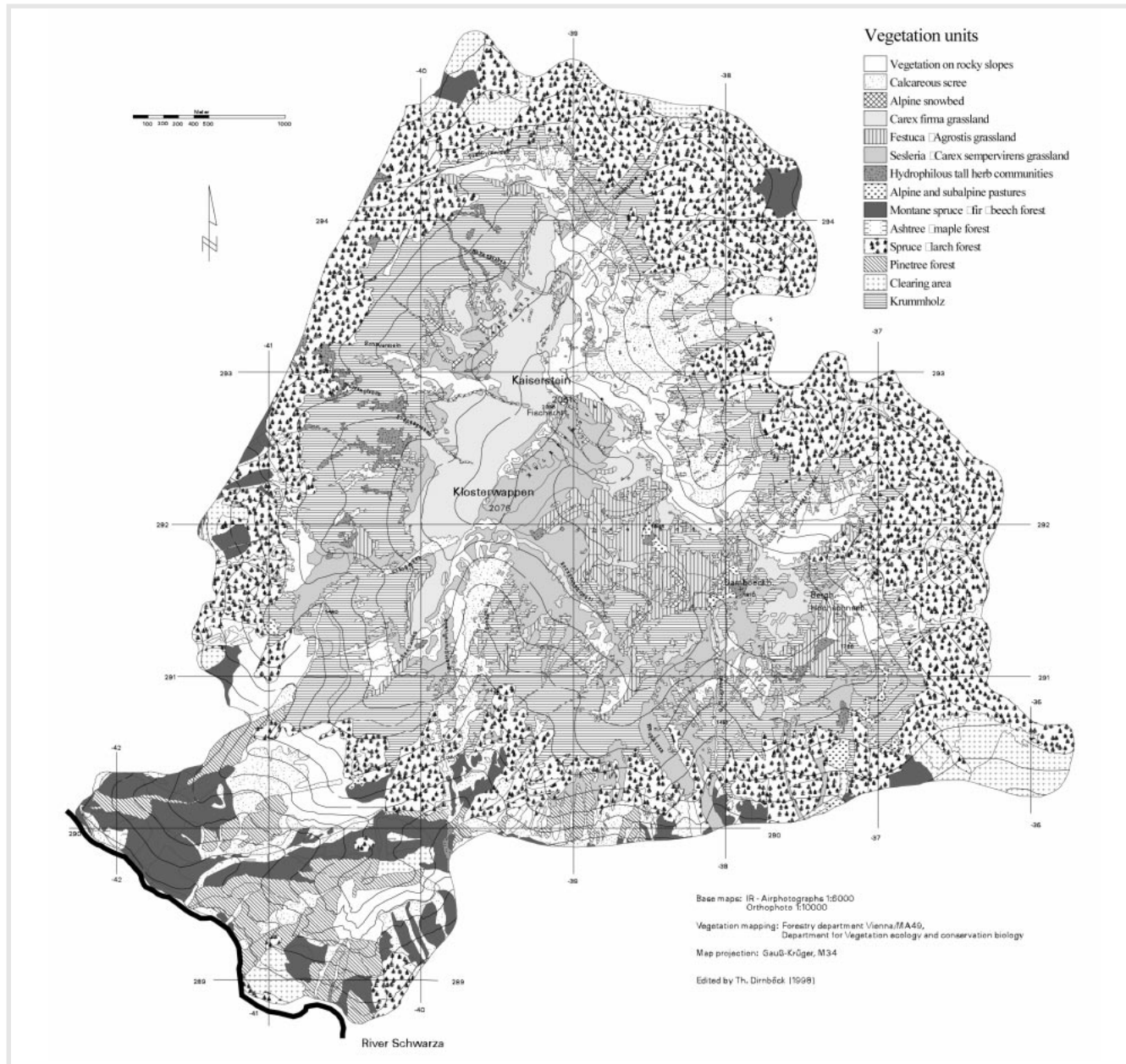
FIGURE 2 Vegetation map of the investigation area.

forest soils are very shallow. Dystric Cambisols were also found on some sites where acidic rock occurs.