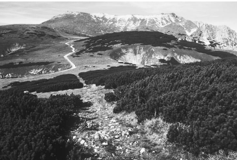
FIGURE 3 The plateau of Mount Schneeberg, showing a particularly disintegrated treeline. Due to summer pasturing, a pattern of krummholz, pasture grasslands on flat sites and natural vegetation in dolines (center and center left), is established. The summit in the background forms a ridge with grassland, scree, and snowbed vegetation as well as rocks on its slopes.

(LAI), and the aerodynamic conditions in and above the canopy, as well as soil water potential and saturation deficit, are important factors that control the transpiration process. A considerable number of catchment studies have been carried out in recent decades in Europe, but they have often produced conflicting results. Nevertheless, the following basic conclusions can be drawn: