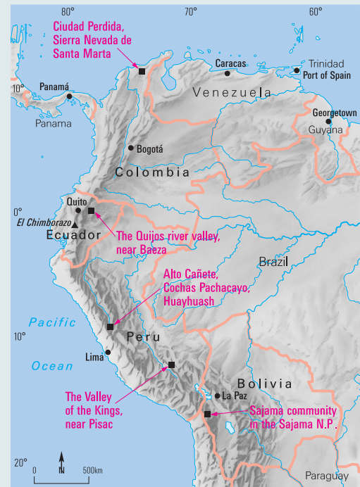
FIGURE 4 Location of 5 study sites on which the Ruta Cóndor/Wiracocha project draws in its attempt to link culturally and biologically important areas along the Andes. See also the article by Fausto Sarmiento et al., "Andean stewardship: Tradition linking nature and culture in Protected Landscapes of the Andes" in a special issue of The George Wright Forum (vol. 17.1, 2000). (Map by Andreas Brodbeck)

These sites, many of which are within or near currently protected areas, include examples of indigenous management, traditional agriculture, sacred sites, ecotourism, and production alternatives. Each of these sites is rich in cultural and natural values and can be sustained only through the stewardship of local and indigenous communities (Figure 5). Over time, it is envisioned that the scope of the project will be expanded to encompass other cultural landscapes in Venezuela, Peru, Ecuador, and Chile. The Ruta Cóndor/Wiracocha project offers great potential to support the stewardship of Andean landscapes on a regional basis.