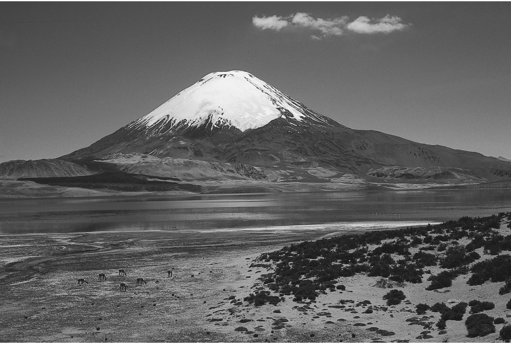
FIGURE 2 Volcán Parinacota (6342 m) with Lago Chungará, the highest elevation lake in the world, at its base. In the right foreground are dwarf woodlands dominated by Polylepis tarapacana , and the left foreground shows wetland habitats termed bofedales with grazing vicuñas.

The relatively gentle topography within the Lauca Basin averages about 4100 m in altitude, giving it an elevation about 500 m higher than Lago Titicaca. Geological evidence and climate indicators such as pollen, evaporites, and sedimentary facies indicate that an arid climate has existed in the Lauca Basin over the past 6.2 million years (Kött et al 1995; Gaupp et al 1999).