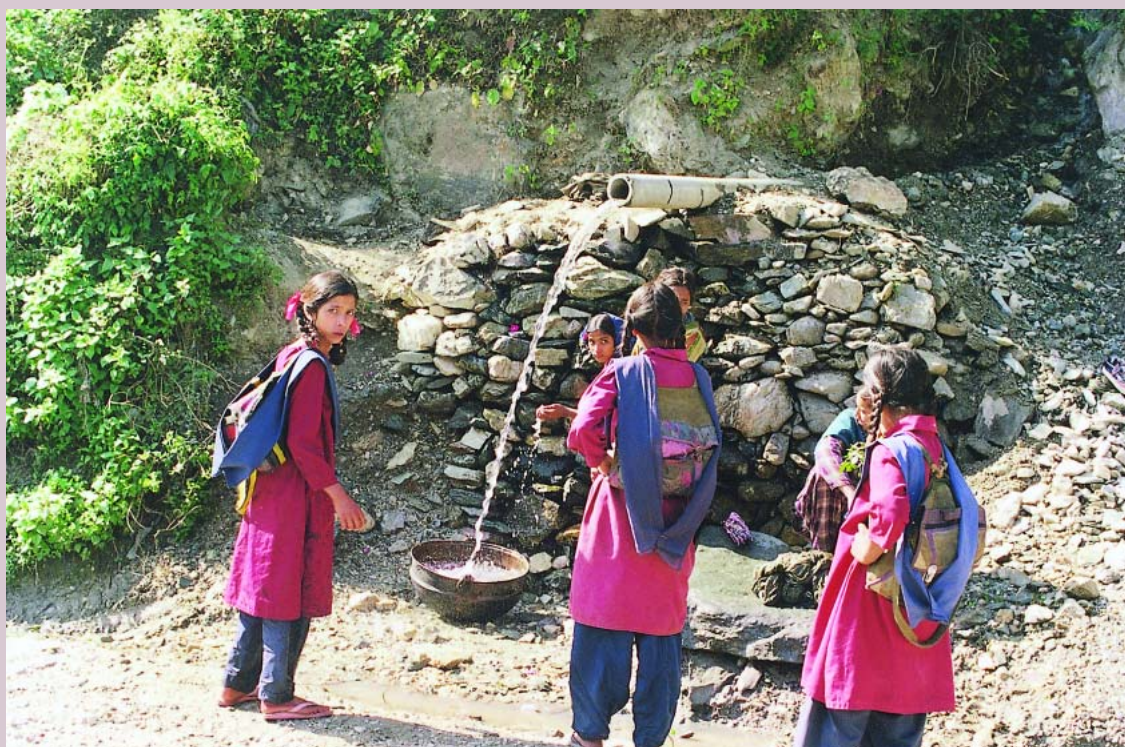
FIGURE 1 Schoolgirls fetching water conducted from a spring by a cement pipe.