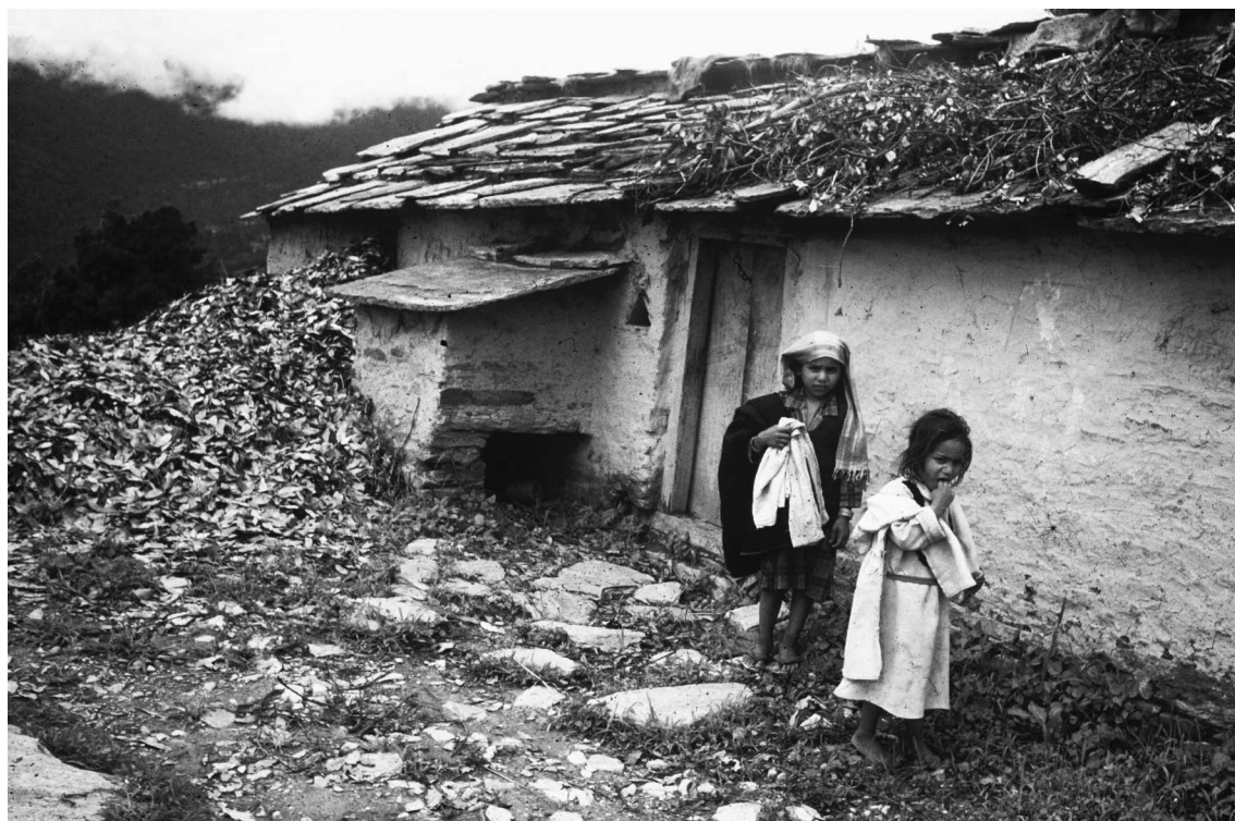
FIGURE 3 A heap of manure outside a livestock shed. Leaf litter from the forest is used as bedding material in such sheds, and the mixture of litter and animal excreta is used as manure in fields. Higher manure input to sustain cash crops results in more intense litter removal from forests.

Himalaya), began cultivation of many costly medicinal plants that used to be harvested from the wild, thus generating income without any significant loss of food crop diversity (Maikhuri et al 2000).