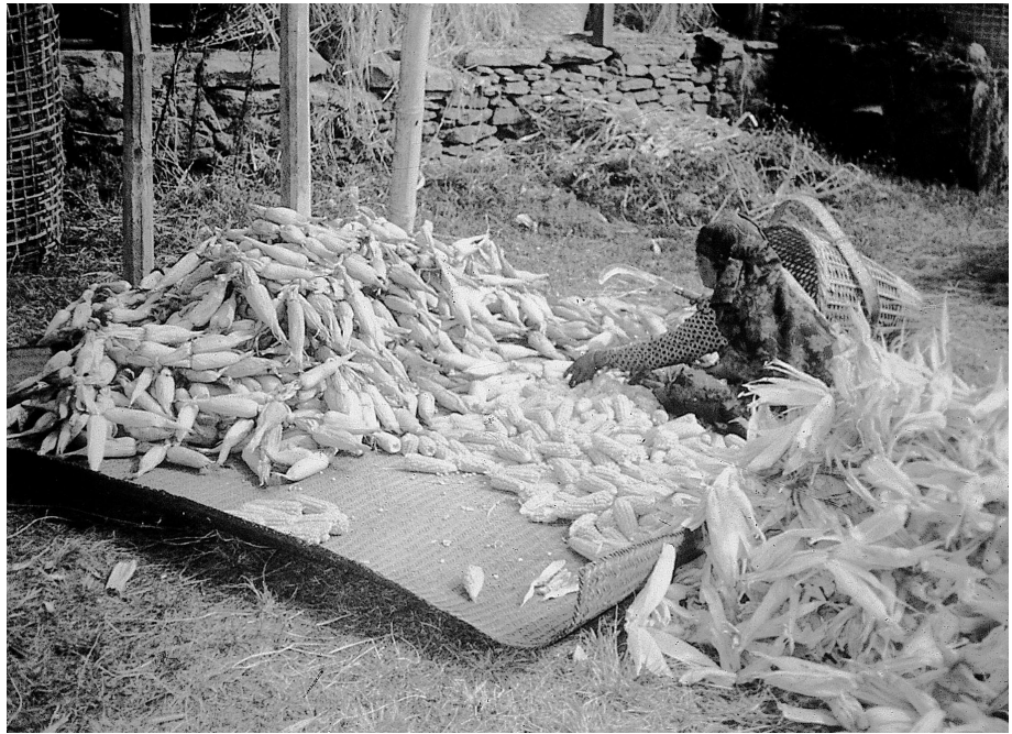
FIGURE 3 Gendered activities such as selecting seeds for consumption or the next year's planting are a vital postharvest task that ensures adequate nutrition in mountain communities.

postharvest activities that includes grain storage, food processing, and food preparation. As grains or other crops come in from the fields, women decide what will be stored, processed, and saved for next year's crops (Figure 3). In making these decisions, women concentrate on providing adequate and nutritious food for their families throughout the year. They must consider factors such as taste and the texture of the food, depending on the meals that will be prepared and whether the food will be fed to children, adults, older people, or particular animals. These decisions are based on considerations that take account of the multiple uses of crops (Sachs 1996, 1997).