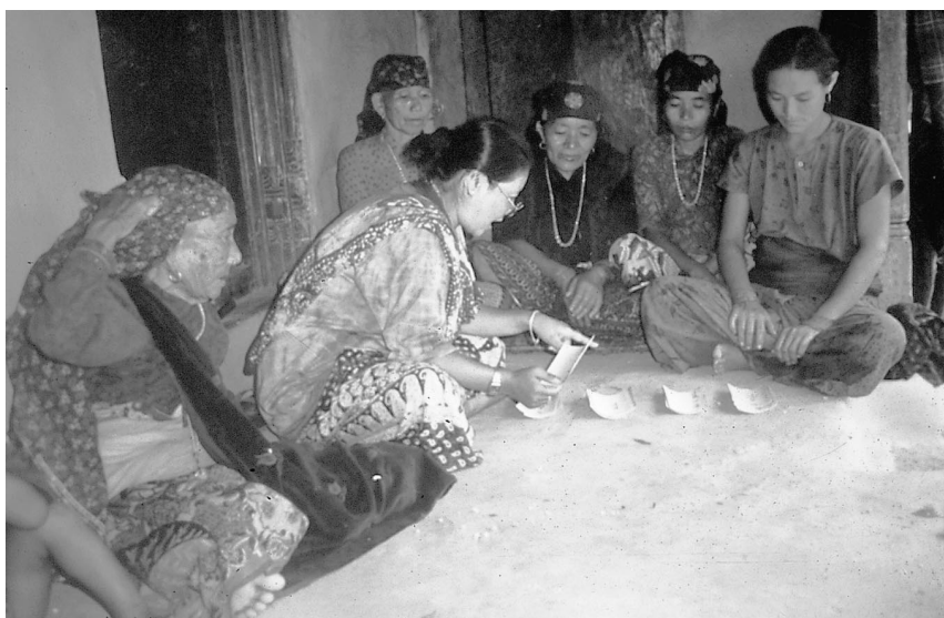
FIGURE 4 A participatory exercise in the study area.

men in Silichong. A workshop was conducted so that the team could define common research objectives, followed by training in concepts and methods of Participatory Rural Appraisal (PRA) and gender analysis. The objective of the research was to gather information on existing crops and varieties cultivated in Tamku VDC, with a particular emphasis on the role of women and men in the management of crops and other livelihood strategies. This initial research was conducted over a period of 3 months, and the results, particularly those factors that contribute to low productivity in crop yields, formed the basis for the next stage in the assessment.