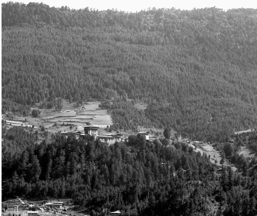
FIGURE 4 Forest cover on the ridges above Jakar dzong (Bumthang district). A mosaic of pastures, cultivated fields, and forests (dominated by blue pine) is seen in the lower part (2700–3200 m). Spruce, hemlock, and fir are found at higher elevations.

combining fast-growing blue pine with dairy production could generate cash returns (annual timber increment and milk value) of US$1000–2000 ha -1 y -1 from land presently used for shifting cultivation. Combining livestock with timber production will generate faster returns than when compared with systems limited to timber production only. Managing systems integrating timber and livestock production will be more demanding than systems focusing on a single output only. Bhutanese livestock producers, however, have convincingly demonstrated that they can manage complicated systems, provided they get the benefit from the outputs produced.