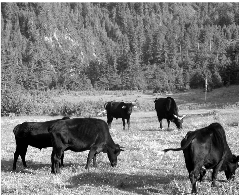
FIGURE 2 Cattle grazing on grassland mixed with blue pine.

Approximately 72.5% of the area of Bhutan is classified as forest. About 27%, or 10,616 km 2 (Land Use Planning Project, unpublished data), of the area is conifer forests (Figure 1), which can be broadly grouped into 6 types (Grierson and Long 1983):