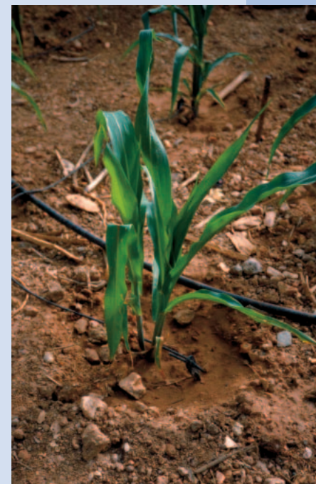
FIGURE 3 View of a drum kit lateral and an emitter applied to a maize crop.

The IDE smallholder bucket and vegetable kits could enable women to be breadwinners (while still respecting traditional obligations) because these kits can be installed in backyards to produce some basic food items. This could improve household living conditions and greatly reduce women's dependence on men. Furthermore, many villages in the high-