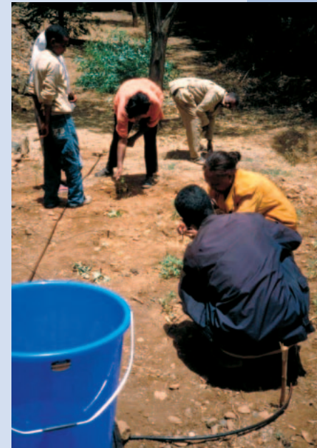
FIGURE 5 Successful use of drip irrigation depends on support from specialists for installation and maintenance.

Last but not least, introducing a new technology means a change in the land use system; therefore, capacity building is essential.