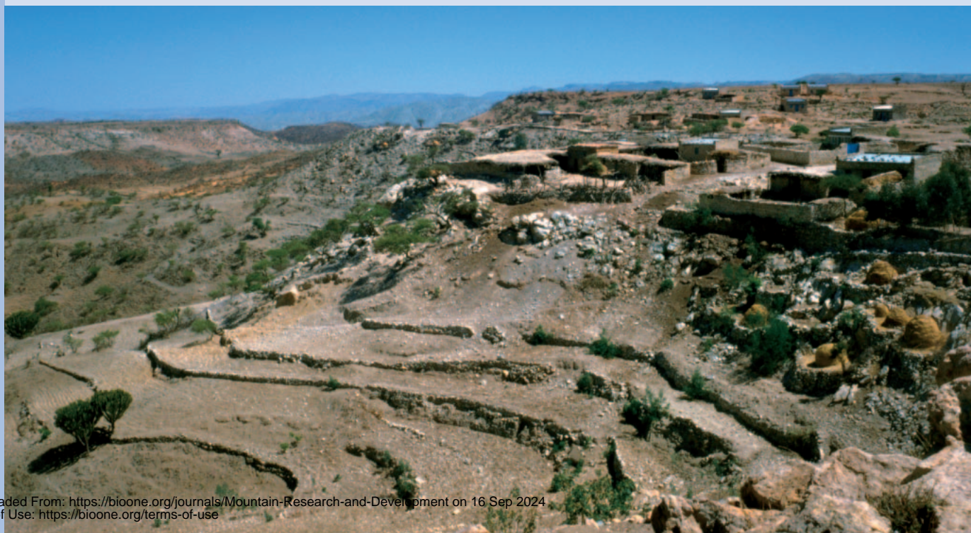
FIGURE 1 Typical farm landscape in the highlands of Eritrea.

Several terms are widely used for drip irrigation: localized irrigation (United Nations Food and Agriculture Organization, FAO), micro irrigation (International Commission on Irrigation and Drainage, ICID), and trickle irrigation