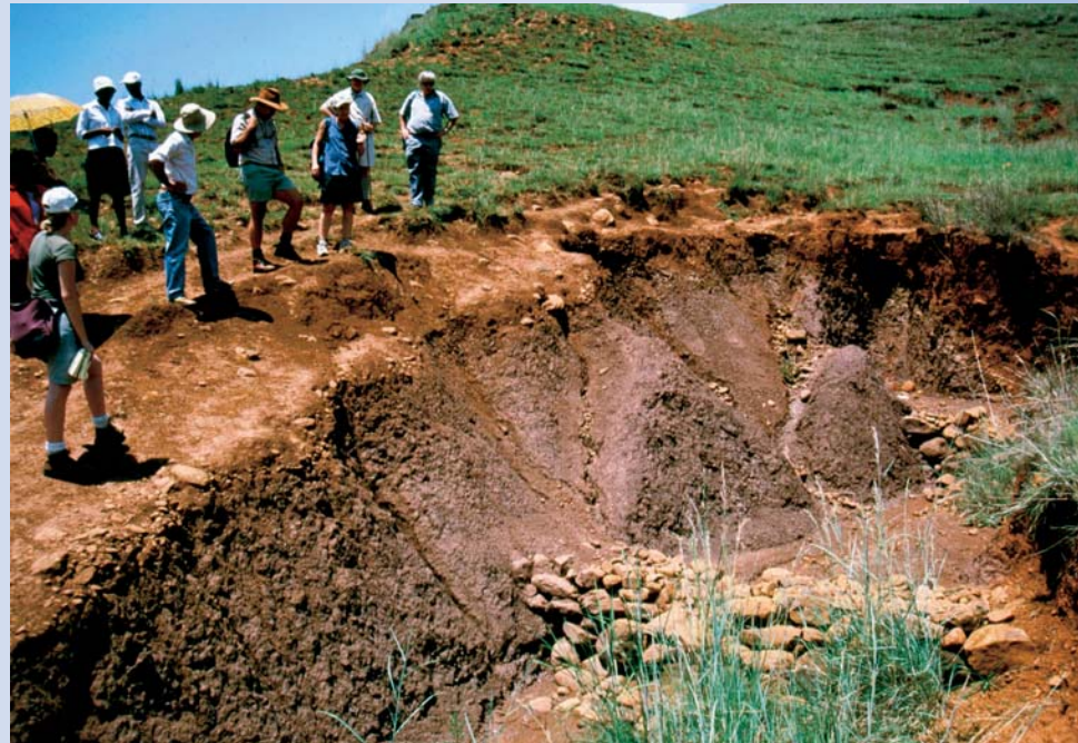
FIGURE 4 Gully erosion near Mnweni, in the Kwa-Zulu/Natal part of the study area. The local community has undertaken reclamation work to halt erosion.

nize and integrate traditional knowledge and community needs and expectations into planning and strategy.