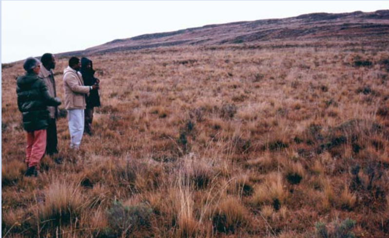
FIGURE 5 Improved rangelands in Lesotho after successful implementation of range management strategies.

help in the development of specific strategies for grassland conservation (see Box).