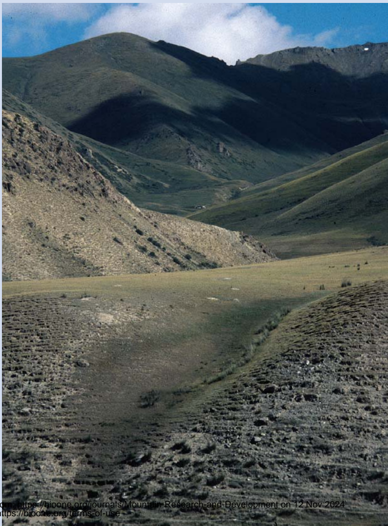
FIGURE 3 Degraded pastures near Tolok, Kyrgyzstan. Such signs of degradation are not a recent phenomenon but stem from Soviet times.

make use of available assets, including human resources, at the household level.