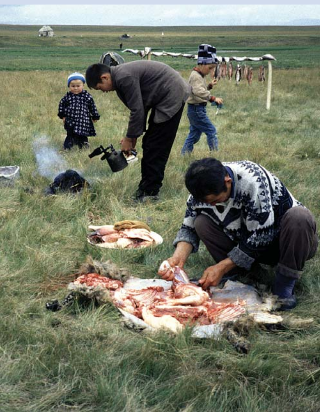
FIGURE 4 Family reunions during the summer months on high pastures are important social events—the slaughtering of a sheep is a must. The promotion of other activities besides sheep breeding could contribute to more sustainable livelihoods and eventually more sustainable resource management.

ture and social services. Using these remote pasture areas again will require considerable investment by government or donor agencies to refurbish infrastruc-