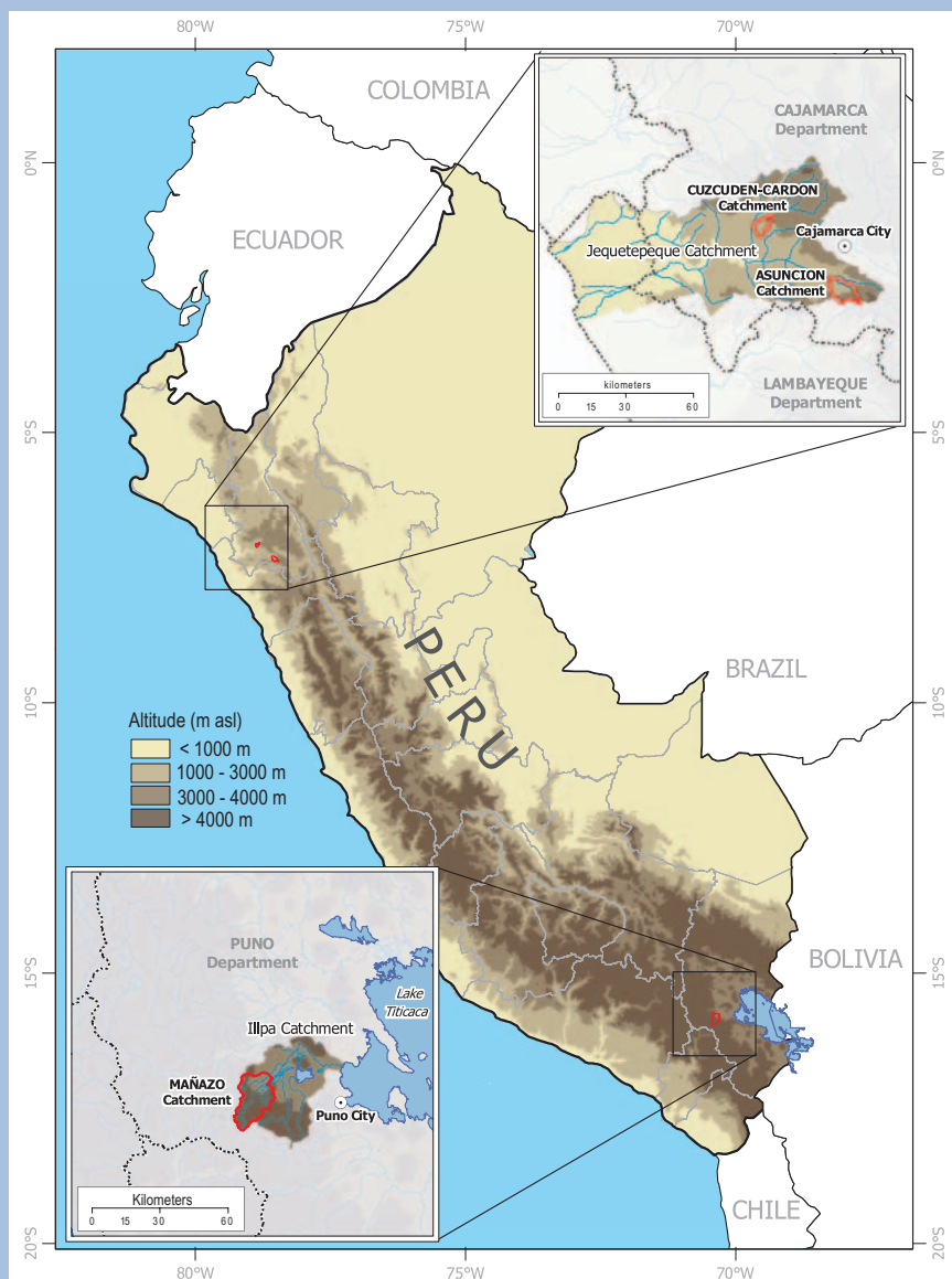
FIGURE 1 The geographic locations of the 3 project catchments in Peru. (Map by Henry Juarez, CIP)

the Peruvian Andes where spatial information played a key role. Can GIS help narrow the gap between professionals and farmers or local officials? Or is it really a top-down tool that requires too much expert knowledge; and are investments too great for remote rural areas? Examples of successful use of GIS are provided in this article, while practical complications and methodological constraints are highlighted.