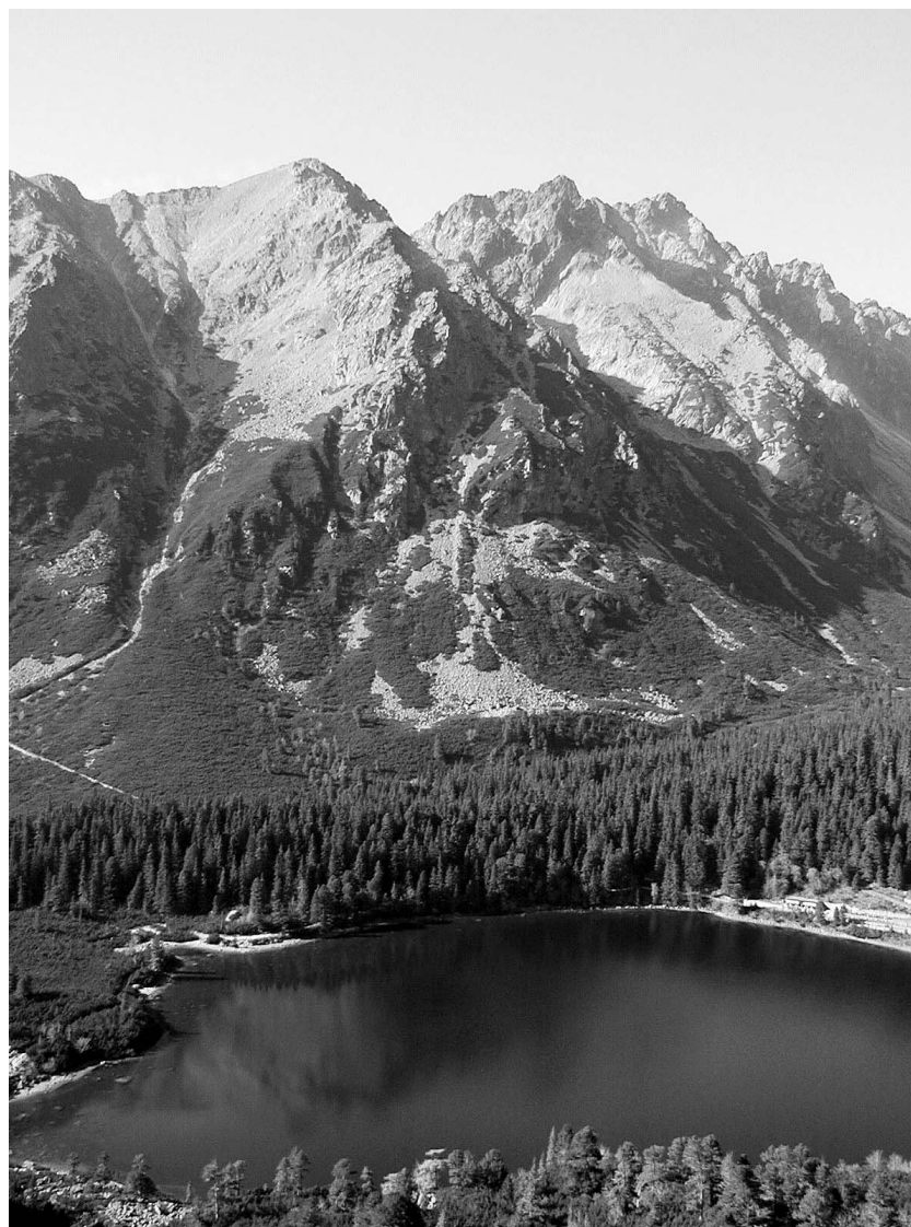
FIGURE 1 The Tatra National Park has many natural mountain pine stands and abundant glacial lakes (here, Popradske Lake).

pean beech, mountain ash, and individual stands of dense mountain pine. Silver fir, cembra pine, and sycamore maple can also be found. The most frequent forest-type groups (original species composition before human influence) are Sorbeto-Piceetum (mountain ash-spruce) and Lariceto-Piceetum (larch-spruce).