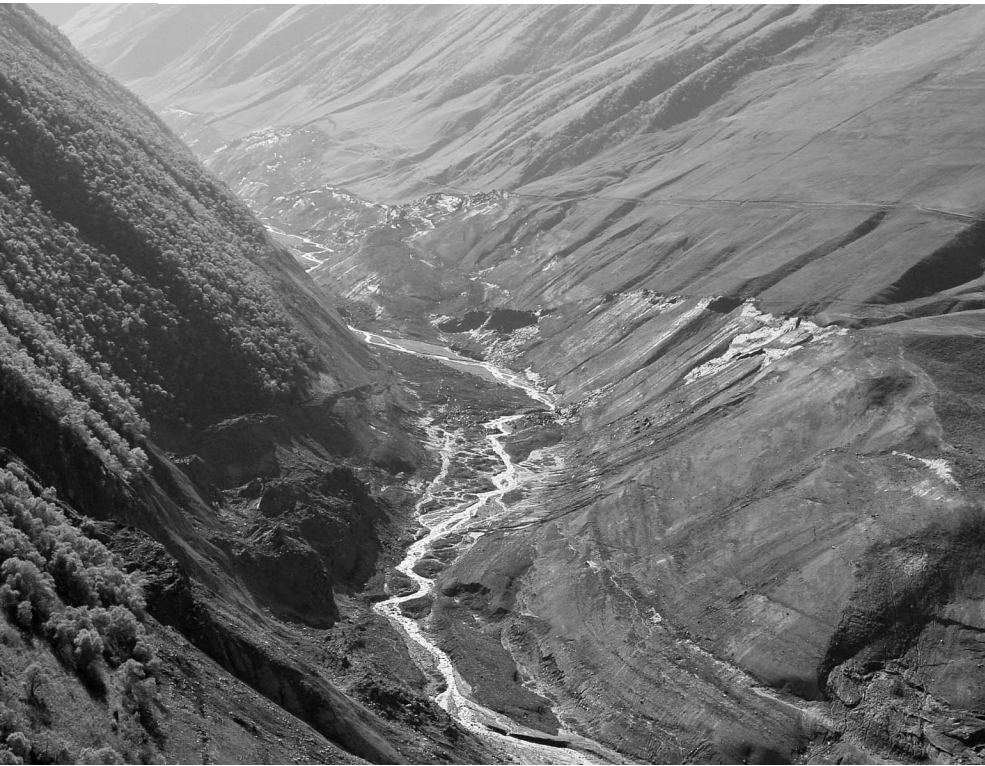
FIGURE 3 Traces of the “waves” left by the glacial debris flow on the slopes of the Genaldon valley. Some reach a height of 140 m.

violently within the boundaries of the Karmadon depression, partly on the Skalistyi Ridge and especially on its Gizel part. (Rototaev et al 1983)