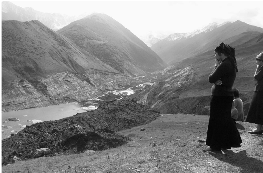
FIGURE 1 View of the Karmadon valley on the morning of 21 September 2002, the day after the natural catastrophe. Completely buried under the mass of ice, stone and water lies the village of Nizhnii Karmadon.

On 20 September 2002, a huge natural catastrophe destroyed the Genaldon valley in the Russian Republic of North Ossetia. Enormous masses of ice mixed with water and stone broke loose and rushed down the valley with high velocity, devastating everything along the way and stripping the slopes of forest and loose sediments up to a height of over 100 m. The avalanche was stopped by the Skalistyi mountain range, which runs perpendicular to the valley, but glacial debris flow burst through and brought ruin for the next 17 km. This occurred late in the evening. The next morning, the view of the path of destruction was stunning (Figure 1). The whole floor of the Karmadon depression was buried under a mass of scree 4 km long and up to 130 m deep. The ice also penetrated through the entrance of the narrow Skalistyi Gorge, thus blocking off both entrances of a tunnel on the main road. The village of Nizhnii Karmadon was completely destroyed and several rest homes along the Genaldon river below the gorge were devastated. Over 100 people were killed.