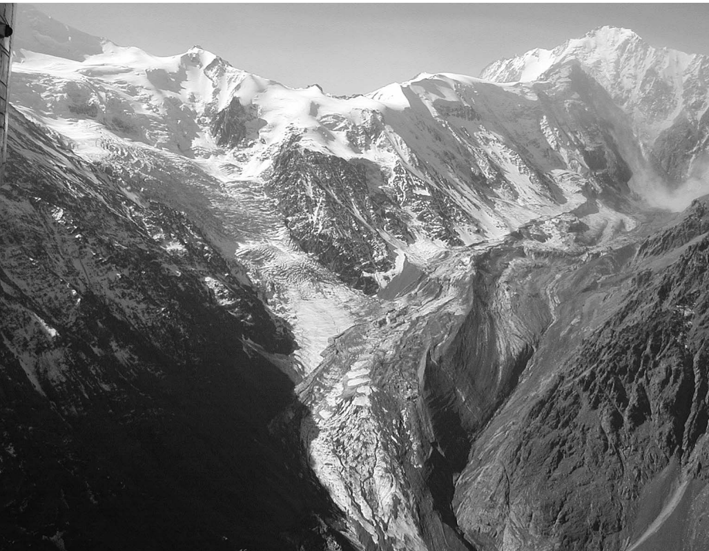
FIGURE 5 Forked head of the Genaldon river after the outburst of the Kolka Glacier. To the left is the practically undamaged tongue of the Maili Glacier, to the right is the cirrus and the Kolka glacier bed.

valley at this place. The increase in base inclination here caused a tearing off of the “tail” of the main mass of the mudflow.