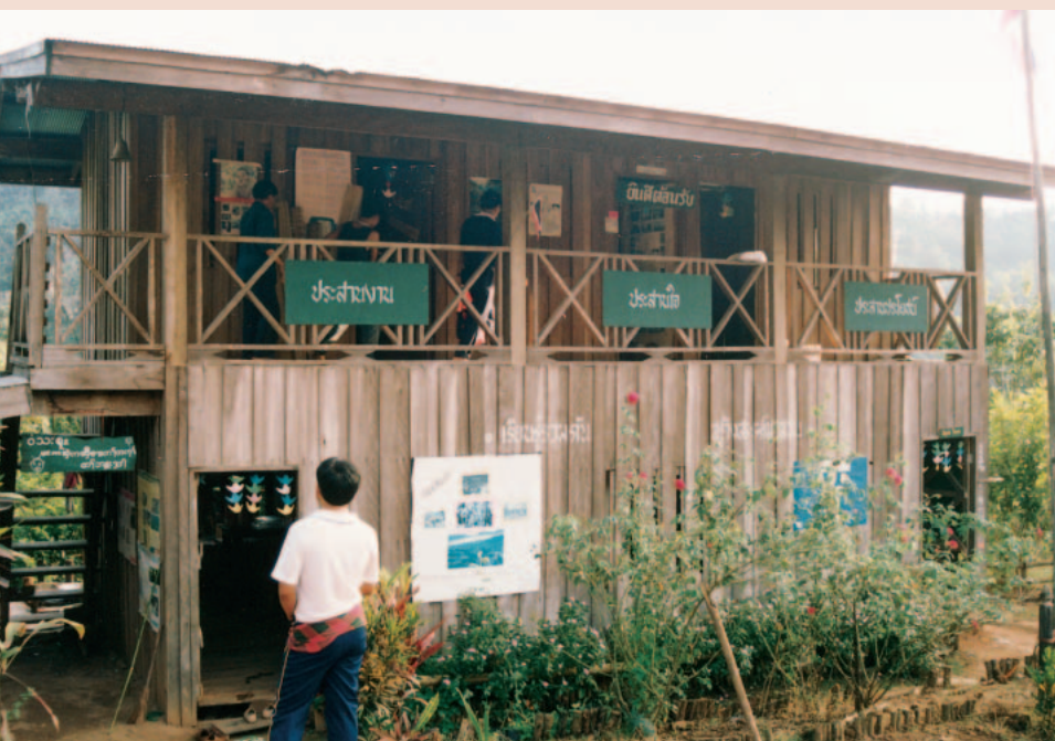
FIGURE 2 A primary health care center, Om Koi—one of the positive outcomes of the Pae Por project.

A substantial number of health facilities and non-formal education centers were established under both projects. In Pae Por HDP, well-equipped schools provided a conducive learning environment for 1500 children—about half of the eligible population—while the number of health centers (Figure 2) was doubled, and staff with hill