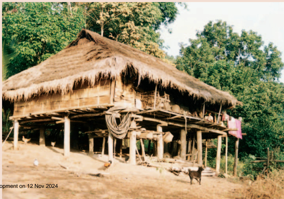
FIGURE 1 A traditional Karen house, Pae Por Highland Development Project.

Both projects aimed to raise the living standards of hill tribe populations by “improving socioeconomic position and self-reliance and progressive integration into the mainstream of Thai society,” as they declared in their project documents. Pae Por Highland Development Project (HDP) was executed by the Department of Local Administration (DOLA) and managed by the 2 District Officers into whose jurisdictions the project fell. At the field level, implementation was centered on 15 “key villages,” each staffed with a 3-person team consisting of a non-formal education