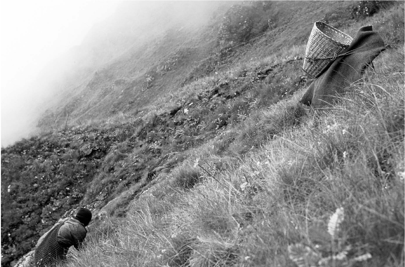
FIGURE 1 Collectors of alpine medicinal and aromatic plants (MAPs) in Gorkha District.

tral development regions of Nepal, and from individuals at the national and international levels in Kathmandu (Figure 2). Overall, 5 categories of stakeholders were identified on the basis of previous studies (Olsen and Helles 1997; Larsen et al 2000):