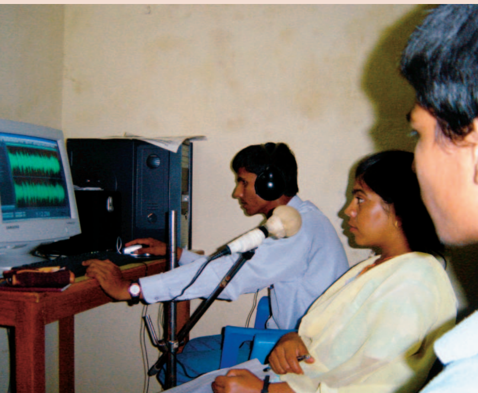
FIGURE 3 Young participants learn to edit audio in the CMC's makeshift studio. Remarkably, Tansen boasts no less than 3 FM radio stations in the town itself.