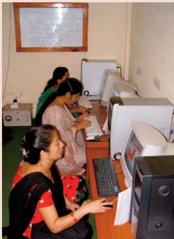
FIGURE 5 Housewives taking a computer course at the CMC in Tansen. Drawing on tradition and saving on furniture costs, the CMC set up computers on low tables so that users could sit on cushions on the floor. The arrangement helps to give the center a less formal air—part of the process of de-mystifying the technology and making users feel at home.

With 3 new FM radios broadcasting from Tansen, at least another 4 FM stations in the area, as well as 5 TV stations in the capital, the Tansen CMC organizers feel they are in a unique position to provide both skilled human resources as well as high quality audio and video program productions.