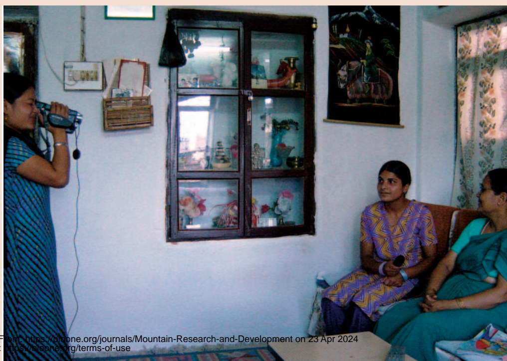
FIGURE 4 Two young producers film and conduct an interview as part of Jeevanko Goreto (Path of Life). The CMC's focus is on youth, and young women constituted a majority of the 174 participants that the CMC trained in the first year of the program.

Direct access to the Internet is also opening up new ideas and spaces for exploration. After a computer training program for 30 housewives, a handful of women have started using email to keep in touch with family members abroad. They also search the Internet for new recipes and hair styles to put to use in small businesses. To address the lack of good materials available in masters-level programs, the CMC is introducing a specialized course for local campus lecturers on searching and using the Internet.