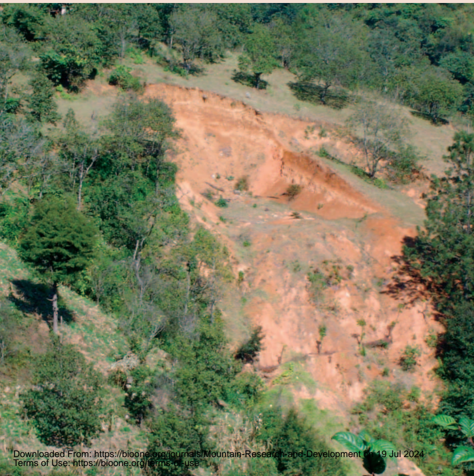
FIGURE 3 Landslides are a common hazard in the Sierra Norte de Puebla.