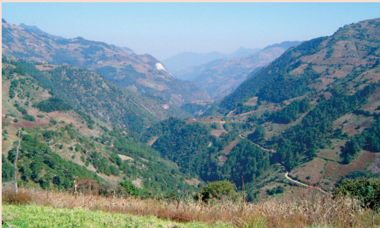
FIGURE 1 View of a valley in the Sierra Norte de Puebla.

In autumn 1999, floods and landslides devastated a mountainous area of Mexico known as Sierra Norte de Puebla. The