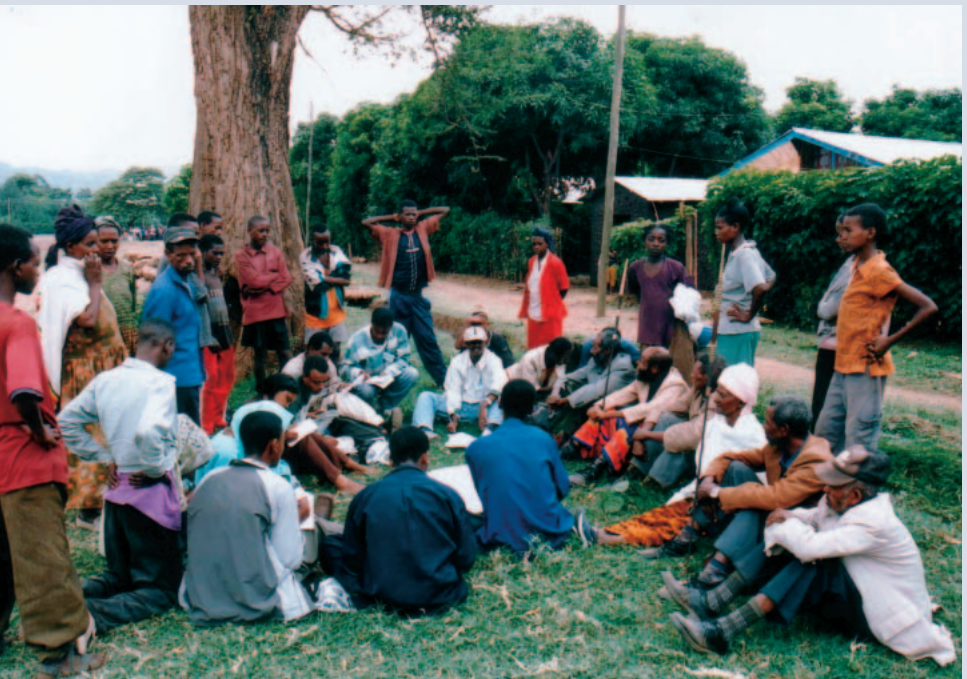
FIGURE 3 Discussion between students and community members in a participatory exercise, Arba Minch, July 2004.

The workshop included practical activities based on participatory rural appraisal methods, and the participants identified activities that the school environmental clubs could carry out.