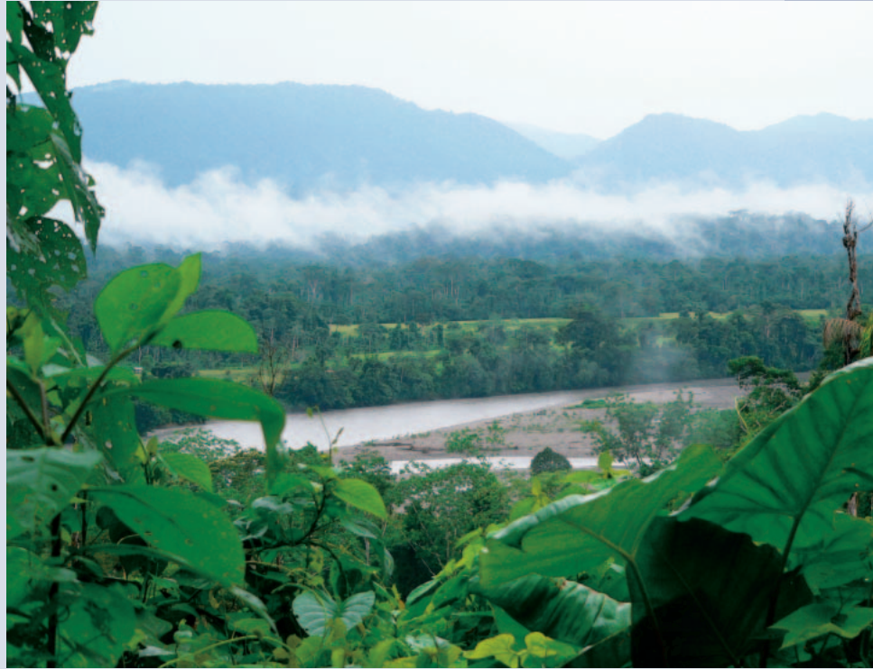
FIGURE 3 Along the road to Shintuya, between the Andes and the Amazonian basin.

as their duties. This is a cultural, economical and political challenge. Four main points have been identified with regard to the RCA's development: