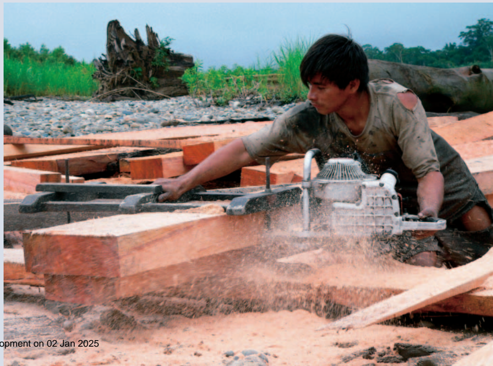
FIGURE 4 Woodcutting near the Madre de Dios River. (Photo by authors, 2005)