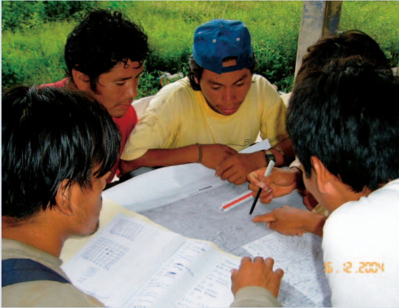
FIGURE 5 GPS training of future Park Guards.