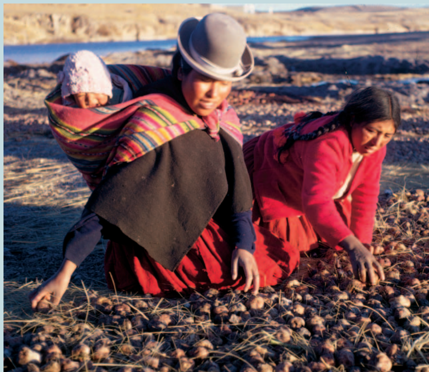
FIGURE 4 Women farmers are key players in ensuring food security.

The solid alliances between CIP and its partners offer a unique opportunity to obtain high social and economic returns on investments in applied research and development in the Altiplano. These part-