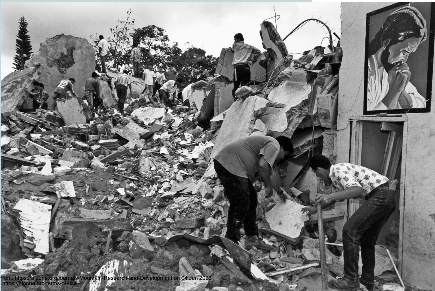
FIGURE 2 How can Catholic faith coexist with violent conflict? Tidying up after combat in San Luis, Antioquia, 1999.

PS: When I work with indigenous communities and talk with them about their problems and their plans, they usually preface