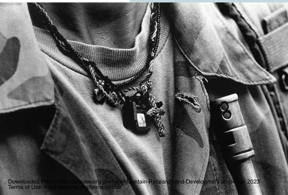
FIGURE 4 An armed guerrilla with Christian symbols of good luck. Achí, Bolívar, 1994.

their lengthy explanations with a remark such as, “Indigenous people like us, who have defended and preserved our identity against foreign invaders for more than 514 years...” This brings 2 of the 3 foundations of their spirituality into play: conscious memory of their long, collective history of oppression, and resistance, with its many victims. Their identity arises from this communal and historical consciousness. It gives them the strength to take action in present-day circumstances, and