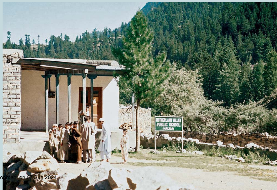
FIGURE 3 A view of the main school in the Naltar Valley.

Effective integration of influential local religious leaders at all levels of thinking, planning, managing, and implementing projects is crucial for long-term research, conservation, and development programs in mountain areas such as the Karakorum (Figure 4). Moreover, reli-