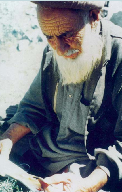
FIGURE 2 A local elder who took an interest in our conservation work and shared valuable information from the past.

remote area, religious leaders of all ethnic backgrounds were contacted. Their viewpoints about nature and their opinions about conserving it were recorded in focused interdisciplinary discussions, interviews, and field interactions.