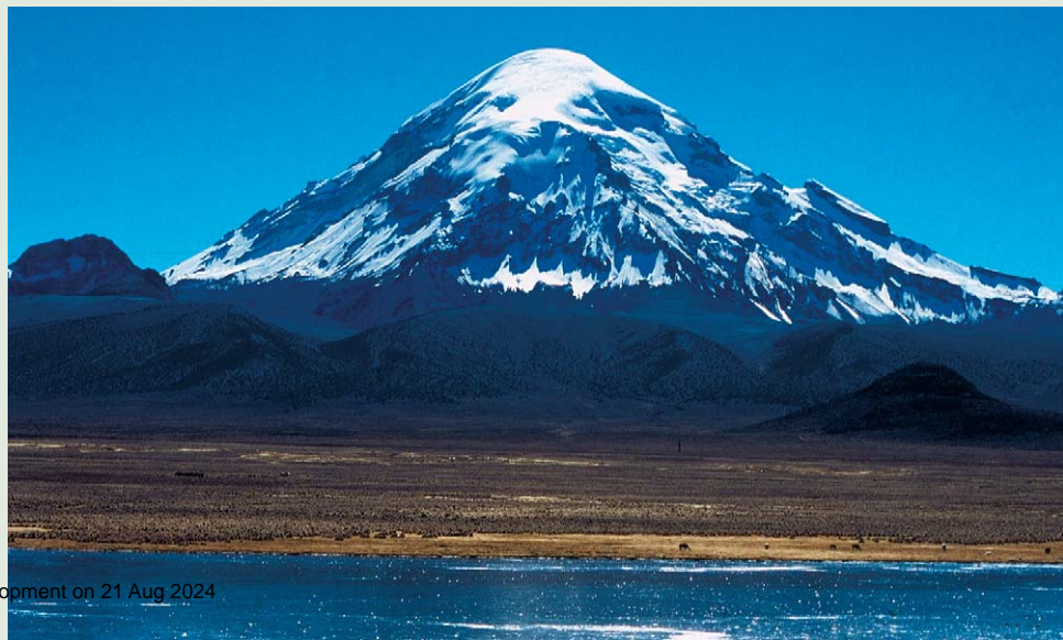
FIGURE 1 Nevado Sajama; in the foreground, a typical wetland.