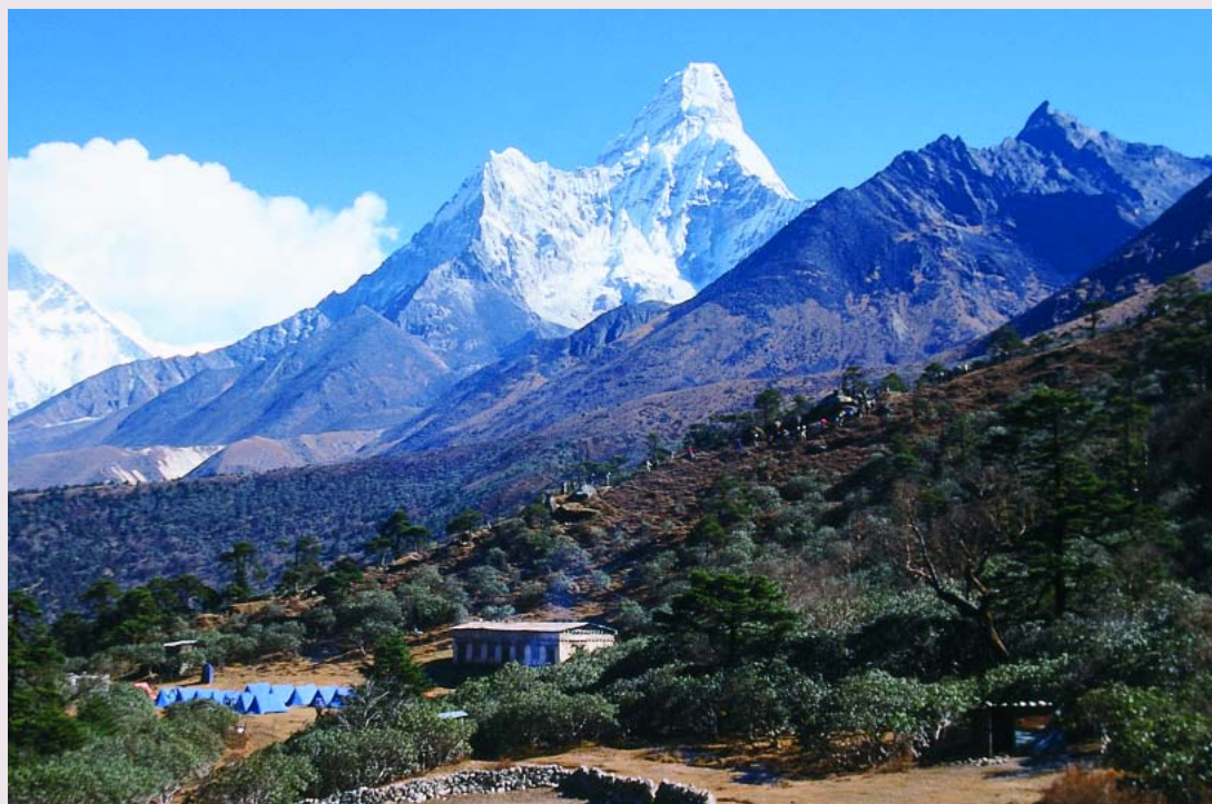
FIGURE 6 Mt Ama Dablam (6856 m) as seen from Tengboche Monastery campgrounds in the Sagarmatha (Mt Everest) National Park of Nepal. High mountains draw thousands of mountaineers to Nepal's remote areas, bringing the much-needed tourism revenues that can promote mountain development.

ignation of International Mountain Eco-tourism Sites (DIMES) would involve stakeholders in mountain ecotourism in developing a set of criteria and indicators to provide a basis for designating a mountain location as an ecotourism destination. The development of such criteria should involve policymakers, practitioners, local communities, and the scientific community. Each designated site should be required to go through periodic evaluation, perhaps every 5 years, to monitor whether or not ecotourism projects are implemented according to the principles laid out by DIMES. Destinations that adhere to the globally recognized principles should be rewarded financially and through other international forms of recognition and merit. Those that fail to adhere to established principles could be delisted.