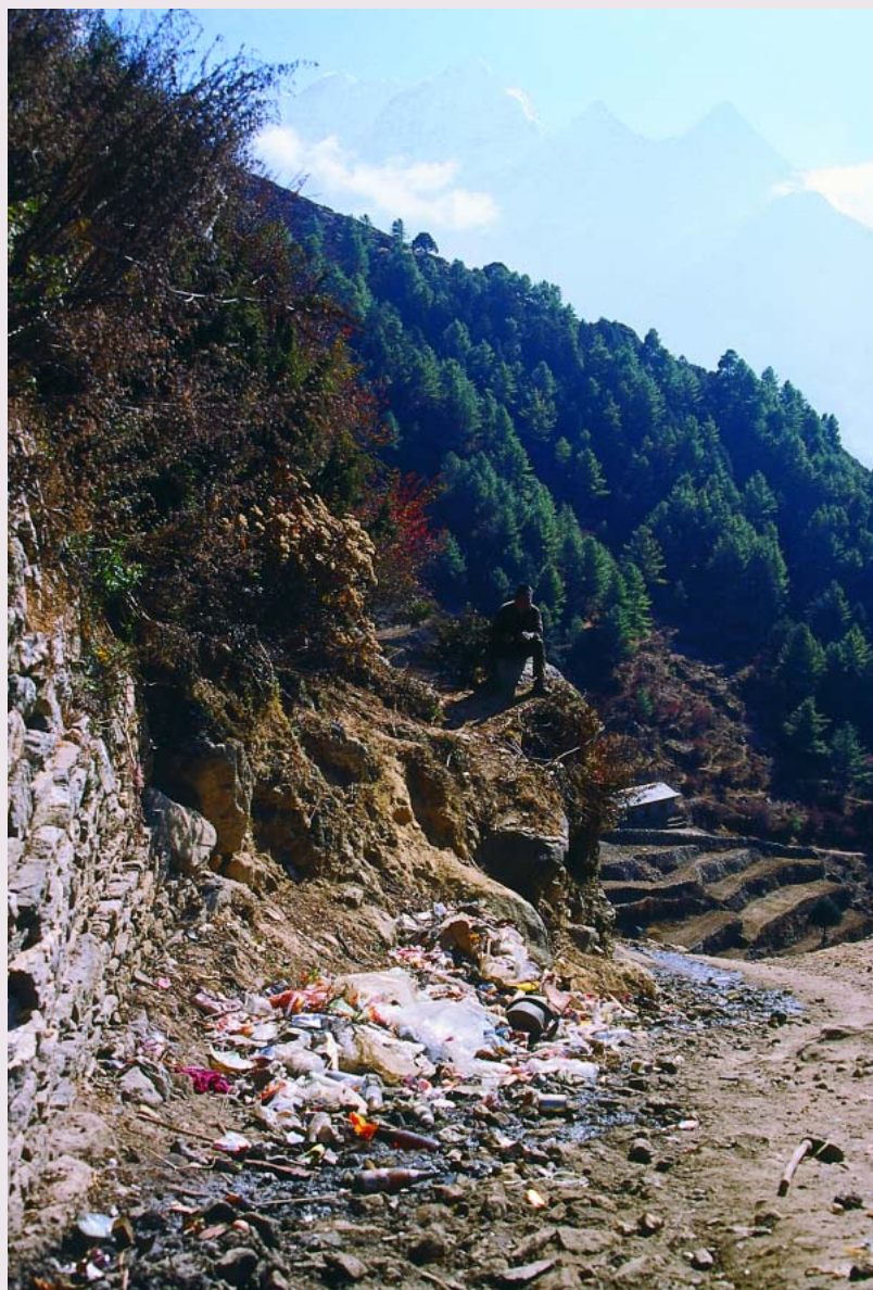
FIGURE 5 Heavy visitor traffic and imported consumption habits produce unmanageable amounts of refuse, as shown here, near the entrance to Namche Bazaar, a high-altitude settlement in the Everest region. Solving refuse disposal problems in remote mountain communities is a difficult task because of lack of transportation, recycling facilities, and institutional support.

tic (ie, people-centered) philosophy and management. These requirements are particularly relevant to mountain ecotourism. More specifically, the following measures merit careful consideration: