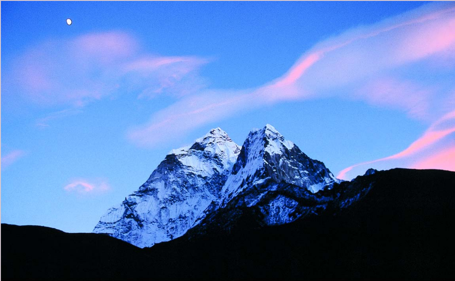
FIGURE 1 Mt Thamaserku (6623 m) in eastern Nepal. Majestic mountains and spectacular views lure thousands of trekkers to Nepal. Without the presence of these towering mountain peaks, remote mountain regions such as Everest and Annapurna would hardly have experienced the level of development they now have.

appreciation of local cultures and traditional lifestyles, and provision of sustainable forms of livelihood for people living in remote areas and communities. The present article provides a brief overview of the trends in mountain ecotourism in developed and developing countries, concluding with a proposed framework for designation of mountain ecotourism sites.