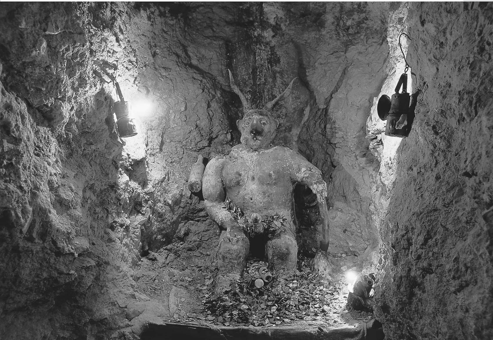
FIGURE 1 One of many tíos in a Potosí mine. According to Estenssoro Fuchs (2003, pp 105–110), Quechua lacks a true synonym for “devil,” or “evil being.” Supay initially meant “phantom,” or “shade,” ie the spirit of a dead person said to counsel the living so that they might find peace through proper deeds. Opposition to and diabolization of supay was the result of the politics of translation amid changing conditions of evangelization.

attendant ceremonies and rites, mean? What are the implications for understanding the natural and social order of mountain societies? What are the relationships between the mythic and religious practices and the sometimes highly controversial politics of development? These questions and issues are treated here in several steps. (1) First, a key anthropological model is introduced for the study of these questions, along with basic notions of Andean conceptions of space which belong to the mythical-religious realm. (2) The next section explores the time dimension of this realm by summarizing selected origin myths and pointing to their relevance for understanding the relationship between the mountainous landscape and its human inhabitants. (3) The third section briefly summarizes the historical formation of this complex under Spanish domination from the 16th to the early 19th centuries. (4) This his-