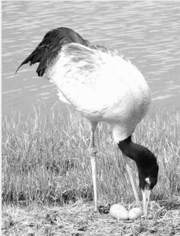
FIGURE 4 An endangered black-necked crane ( Grus nigricollis ) tending its eggs on the shore of a Ladakh high-altitude lake.