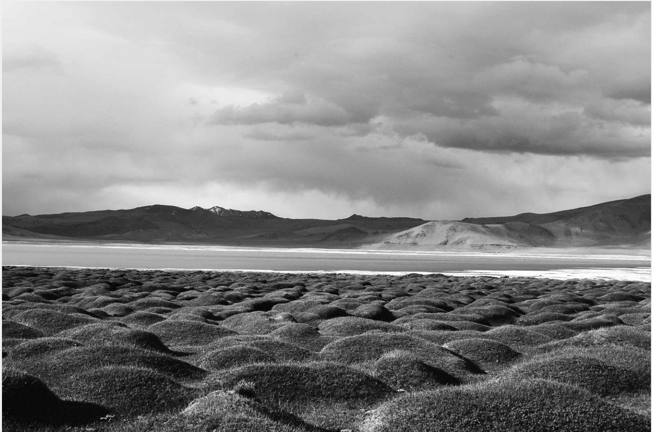
FIGURE 3 High-altitude lake and wetland in Ladakh.

habitat for many medicinal plants that are being increasingly used for commercial purposes. In addition, due to their scenic beauty, these areas are often locations for tourism development. Therefore, there is no doubt that alpine meadows provide many ecosystem goods and services, not only locally but also on the national and international scales. However, alpine meadows are facing severe degradation due to climate change (rising temperature), which leads to: