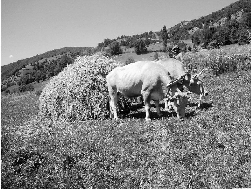
FIGURE 5 Ox-drawn sledge loaded with oats, v. Shkaleri (1307 m).

landraces of wheat and barley are used to prepare bread and beer for religious rituals. Substitution of these landraces by others would go against centuries-old traditions.