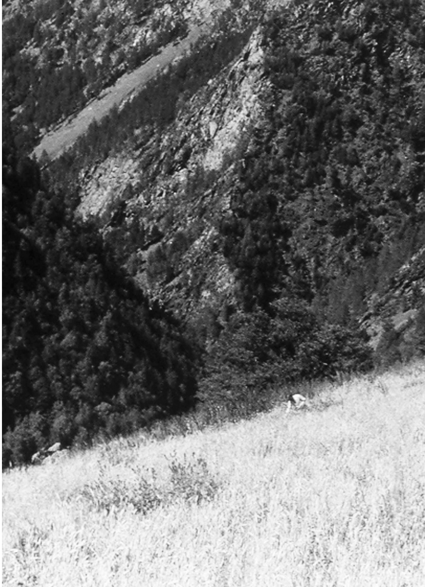
FIGURE 4 Highest registered wheat field in Georgia, in v. Chero (2160 m).

in such high villages. Most varieties growing in mountain areas are local landraces and cultivars. Mountain landraces of rye ( Secale cereale ) and barley ( Hordeum vulgare var. nudum , H. vulgare var. pallidum ) reach their highest elevations in v. Ushguli (see Figure 1). The highest wheat field ( T. aestivum var. lutescens ) was discovered in 1986 by Georgian botanists in v. Chero at 2160 m (Figure 4).