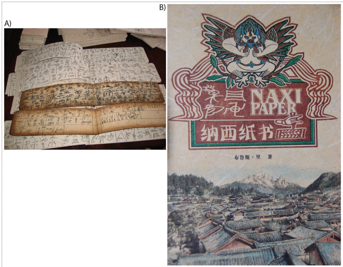
FIGURE 2 (A) Traditional Dongba papermaking. (B) Commercial Dongba papermaking.

that produce paper in the community, all interviewed households have knowledge of the habitats, types, traditional processing, and use of W. delavayi resources. Other than for papermaking, informants in Kenbeigu manage W. delavayi resources in their land use schemes for medicine and as a natural pesticide that grows in their home gardens and fields.