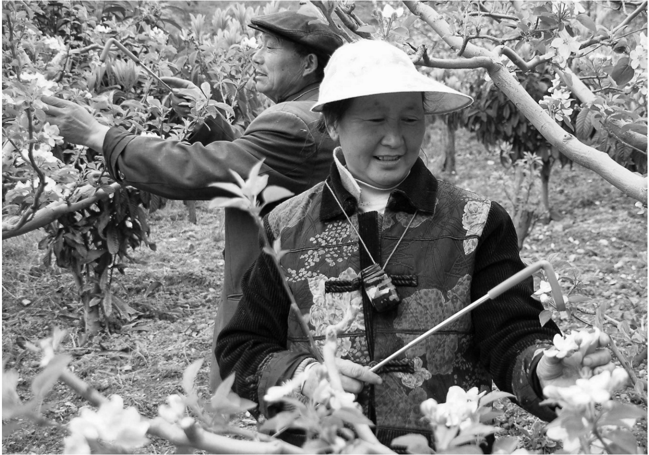
FIGURE 2 Farmers pollinating apple flowers in Feng Mao village.

chosen for gathering folk observations about the scale and pace of changes in agricultural systems and climate. A few beekeepers in the valley were also interviewed to understand access to beekeeping as a tool for managing fruit pollination in the valley and whether farmers are now using it. Secondary data on population, agriculture, average land holdings, and meteorology were accessed from literature and government sources.