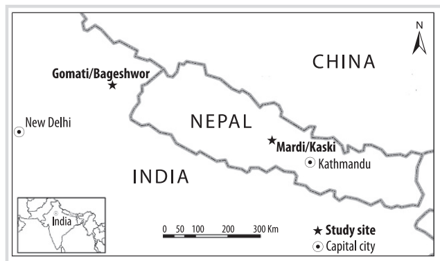
FIGURE 2 Location of study villages. (Map by Prem Sagar Chapagain)

conservative ones in Nepal. The twofold intention of the comparison is, as stated previously, to document variation and to identify circumstances that are favorable to innovation.