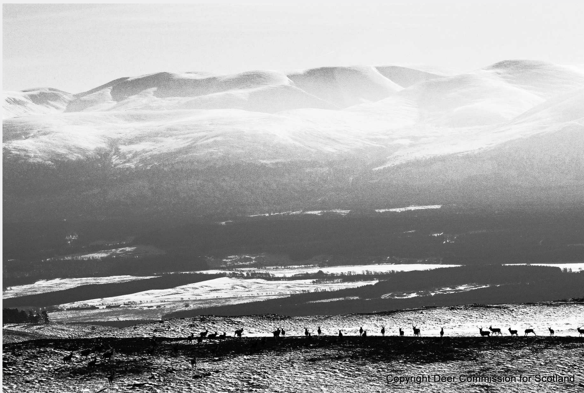
FIGURE 1 Red deer on Alvie Estate in the Cairngorms.

These efforts have led to the development of detailed maps of a continuum of wildness in the 2 national parks in conjunction with the on-going delineation of core areas of wild land and development of planning guidance. More recently, Scottish Natural Heritage has used this methodology to develop maps of wildness for Scotland as a whole. These were completed in 2012 and represent a landmark, with Scotland leading the way in producing Europe's most accurate and detailed maps of wildness.