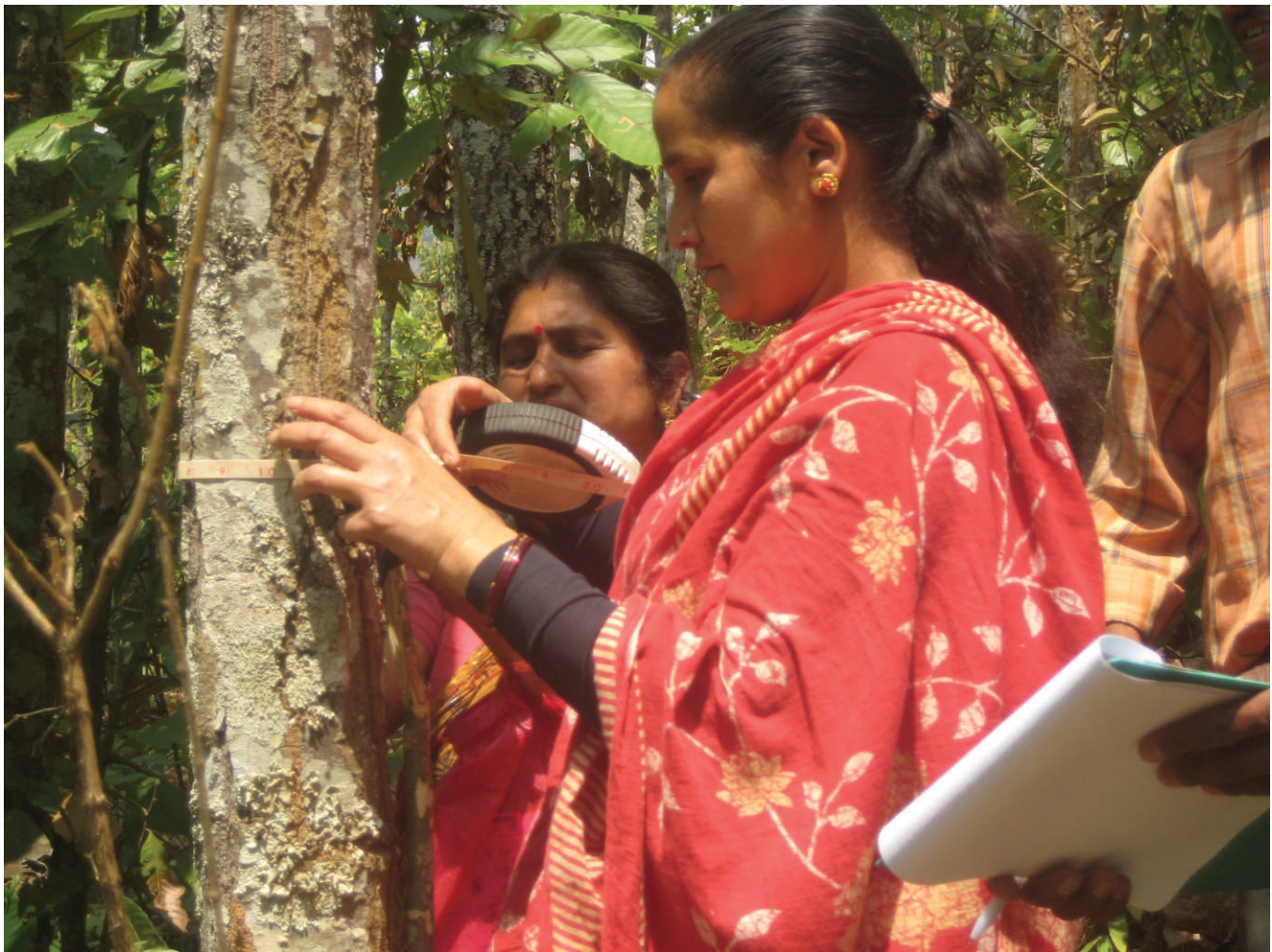
FIGURE 1 Woman forest user learning how to measure tree girth in the REDD+ pilot site.

ethnicity, wealth, and location produce many institutional challenges to the empowerment of the poor, women, and socially excluded groups in Nepal (Nightingale 2005, 2011; World Bank and DFID 2006; Khadka 2009).