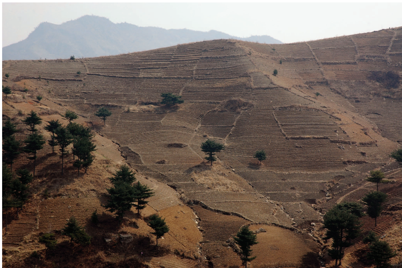
FIGURE 1 Extensive farming on steep slopes after famine in the 1990s. (Photo by Jianchu Xu, taken in North Hwanghae Province in 2008)

constituted the most important criteria (Franzel et al 1995). Therefore, the principle of “right species for right place” requires that the preferences of local stakeholders and ecological suitability both be considered, paying particular attention to local ecological knowledge (Reubens et al 2011; Suárez et al 2012). There is an urgent need to develop ways to manage sloping land that strengthen the multifunctionality of the forest ecosystem and focus on multipurpose species selection.