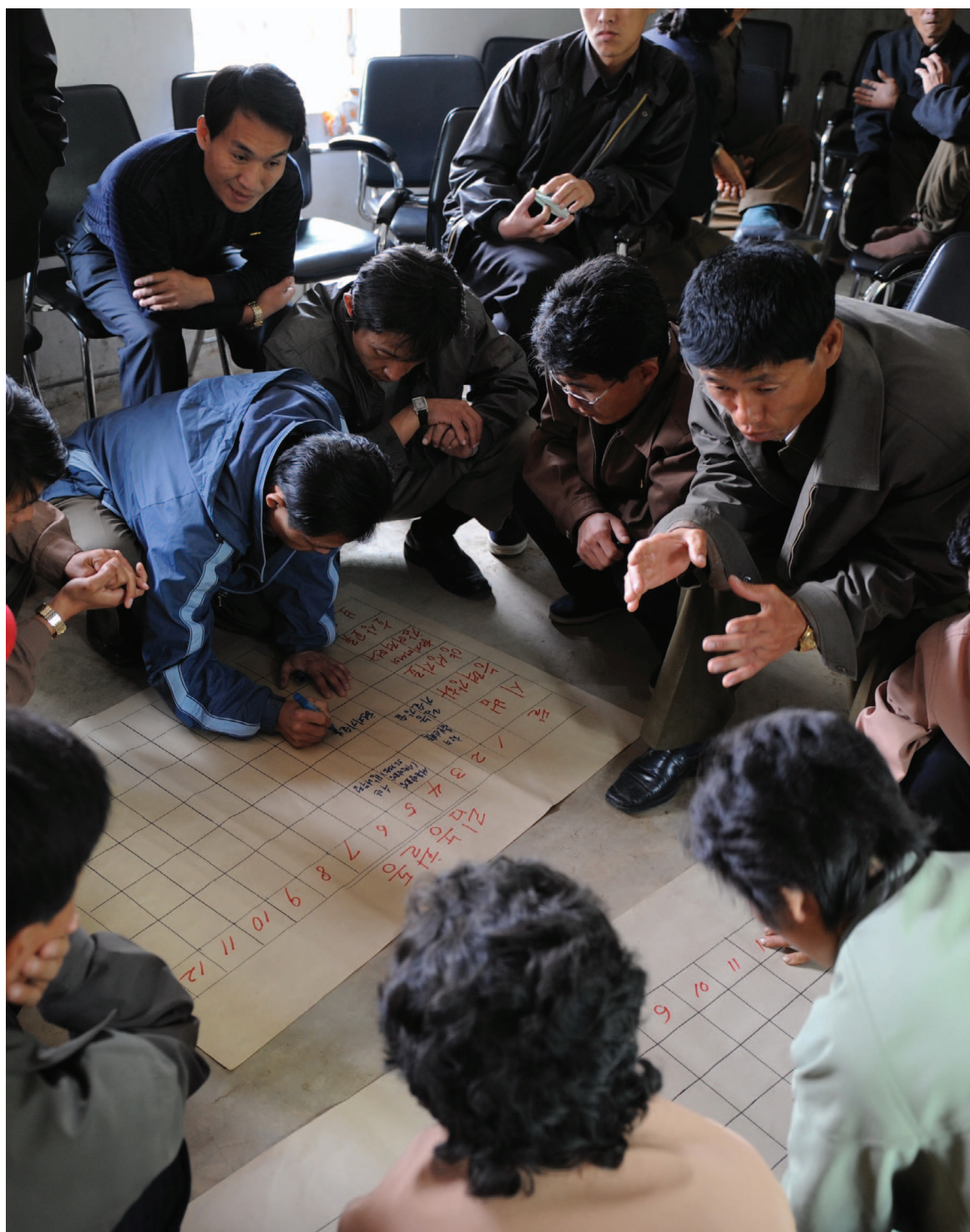
FIGURE 4 The participatory approach empowers local people to become involved in decisions about tree species selection for agroforestry on sloping land.

and land-use types (eg agroforestry or timber system), and should yield the products and services (eg fruit, timber, firewood, other income-yielding products, and erosion control) prioritized by the land managers, in this case the