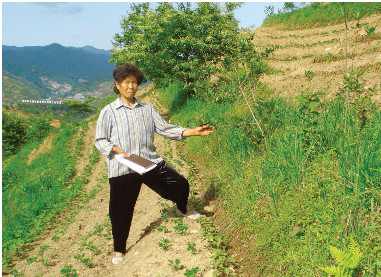
FIGURE 2 Selecting the right species not only helps to restore the ecosystem but can also contribute to local livelihoods. (Photo by Jianchu Xu, taken in Suan County in 2012)

Currently, however, there is limited information on the selection of indigenous tree species for sloping-land agroforestry, in particular on participatory experiences in a highly centralized country like North Korea. Drawing on empirical data, this research highlights the importance of such an approach. It may produce valuable insights for participatory research and practice in 3 aspects: