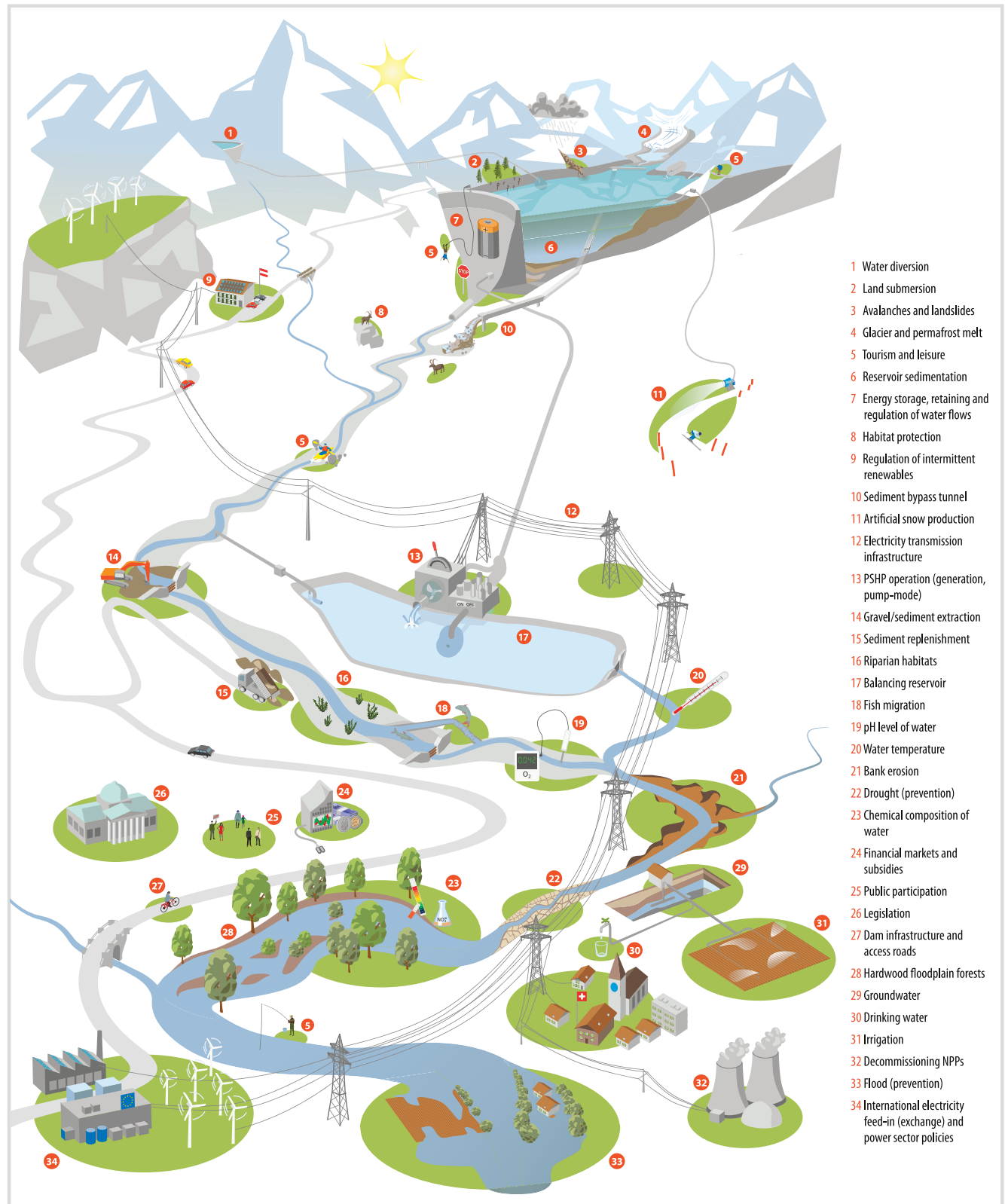
FIGURE 1 System view of PSHP operation with environmental, economic, and social relationships. (Diagram by Valentin Rüegg and Astrid Björnsen Gurung, with inputs from workshop participants)