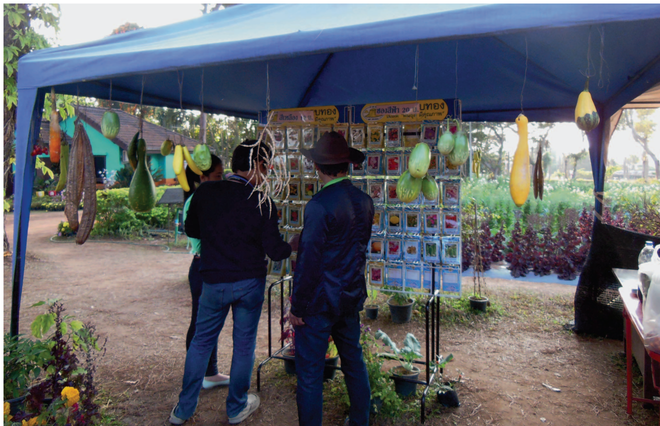
FIGURE 3 Tourists visiting a flower farm.

Phu Ruea's winter flower festival, and operate a market selling local handicrafts and agricultural products.