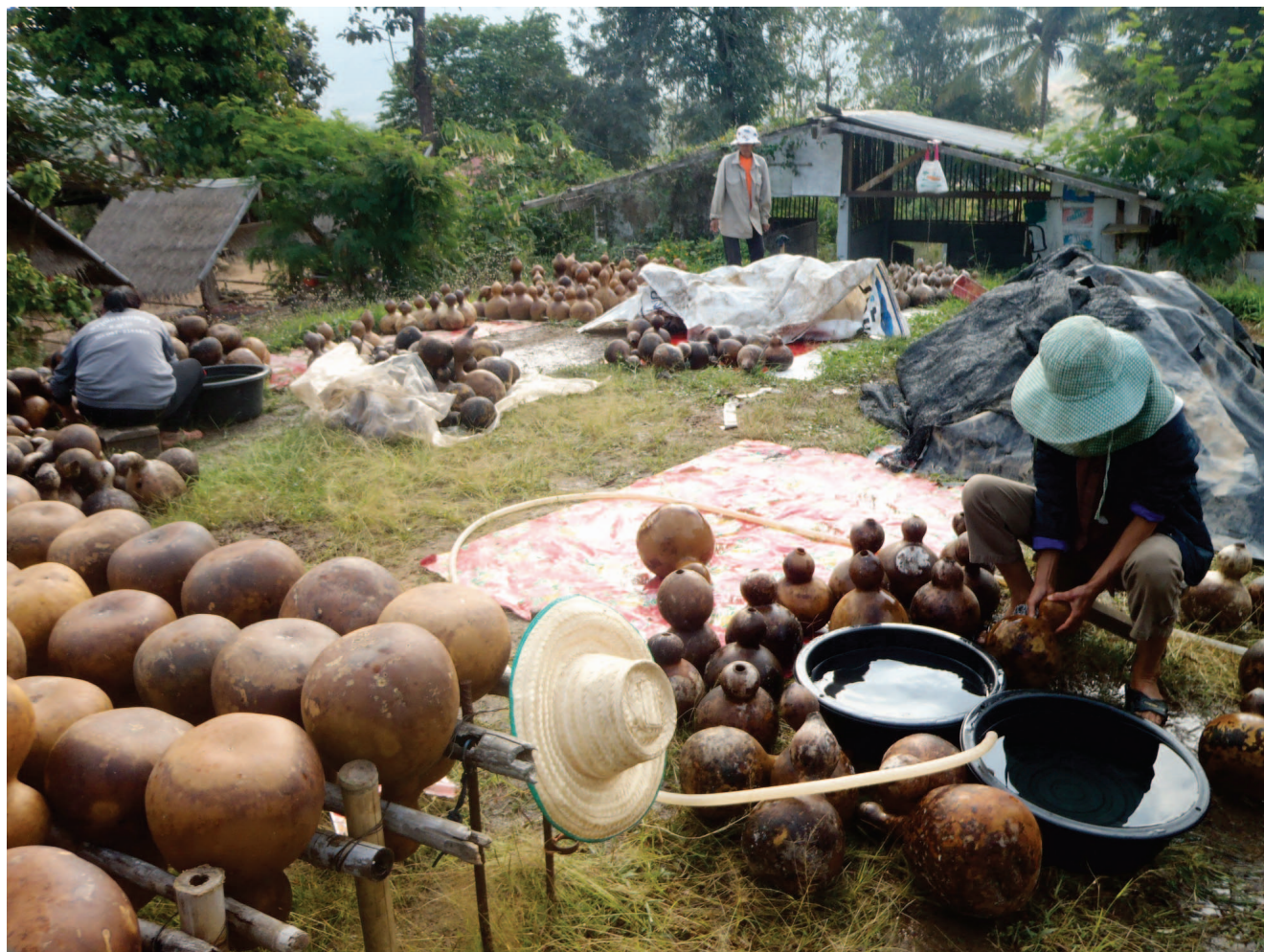
FIGURE 4 Workers transforming gourds into souvenirs.

Hired workers: There are about 1000 hired workers, most of whom (90%) are local residents from farm households. The remaining 10% are temporary migrants who come mostly from Laos. Maids in the hotels or resorts are usually middle-age females, and waitresses in the restaurants are usually young females. Workers on the flower farms are usually middle-age people of both sexes.