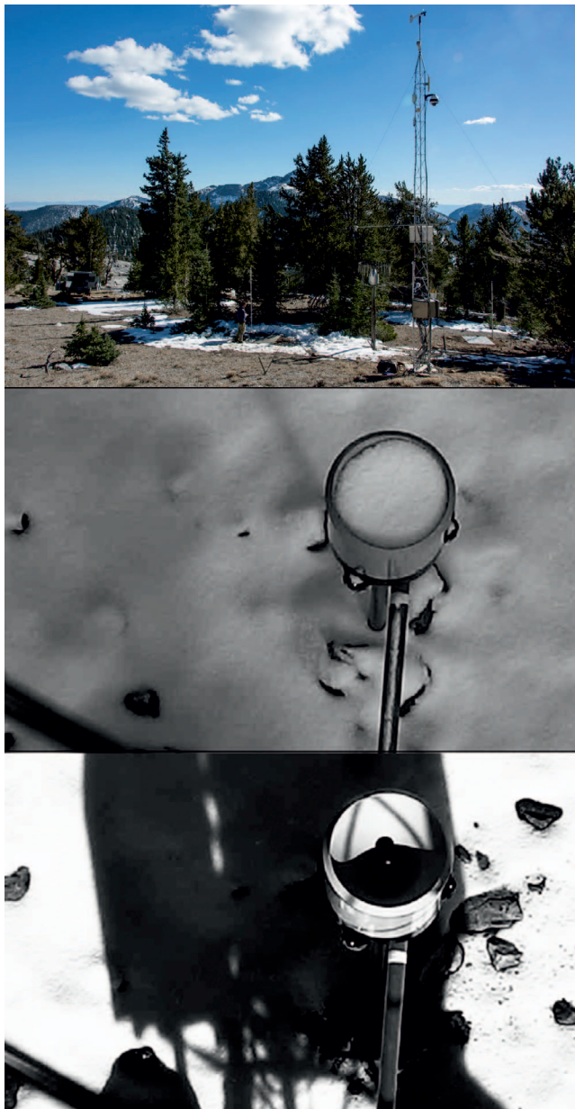
FIGURE 3 Using a webcam as part of an environmental sensor deployment (top) allows the operator to capture images that assist data quality control. In this case, hourly images can show if precipitation is in solid form (middle), which is not usually captured properly by instruments such as a liquid tipping bucket gauge (bottom).