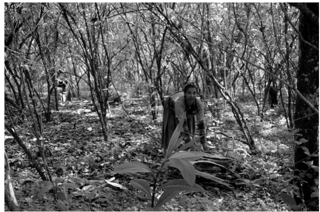
FIGURE 2 Women collecting firewood from the buffer zone coffee forest, Bondo Megela, Yayu.

Gender roles in this community are very traditional; women are responsible for food preparation and decide what is cooked and how it is prepared. Nutrition remains a woman's responsibility. This arrangement is reinforced by the fact that health extension agents work mostly with women, so that women's knowledge of nutrition is much more advanced than men's. Women describe themselves as heavily overburdened with work and cultural responsibilities, working up to 18 hours per day, compared with 8–10 hours for men (this was confirmed in interviews with men). Several women stated that they would not be able to collect anything other than firewood from the forest. Interest in and capacity for training are limited; as 1 woman (Gaba, age 37) said, "We are sitting in trainings, thinking of the household chores that need to be done at home."