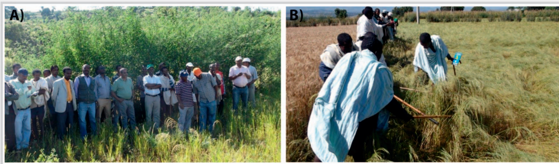
FIGURE 1 Learning watersheds used as live learning platforms: (A) regional policymakers led by the regional president appreciating progress in a learning watershed; (B) farmers checking a newly introduced crop variety and comparing it with their local variety.

Over the last centuries, water and land resources in the Ethiopian Highlands have been subject to increasing demand from subsistence farming and other forms of agriculture. This has had negative on- and off-site effects, both in Ethiopia and in downstream countries. Increased sediment load in the Nile River, leading to siltation of downstream hydropower and irrigation dams in Ethiopia, Sudan, and Egypt, poses a major threat to infrastructure investments as well as to local livelihoods. At the same time, the loss of fertile soil and nutrients has reduced the productivity of rain-fed agriculture in the Ethiopian Highlands.