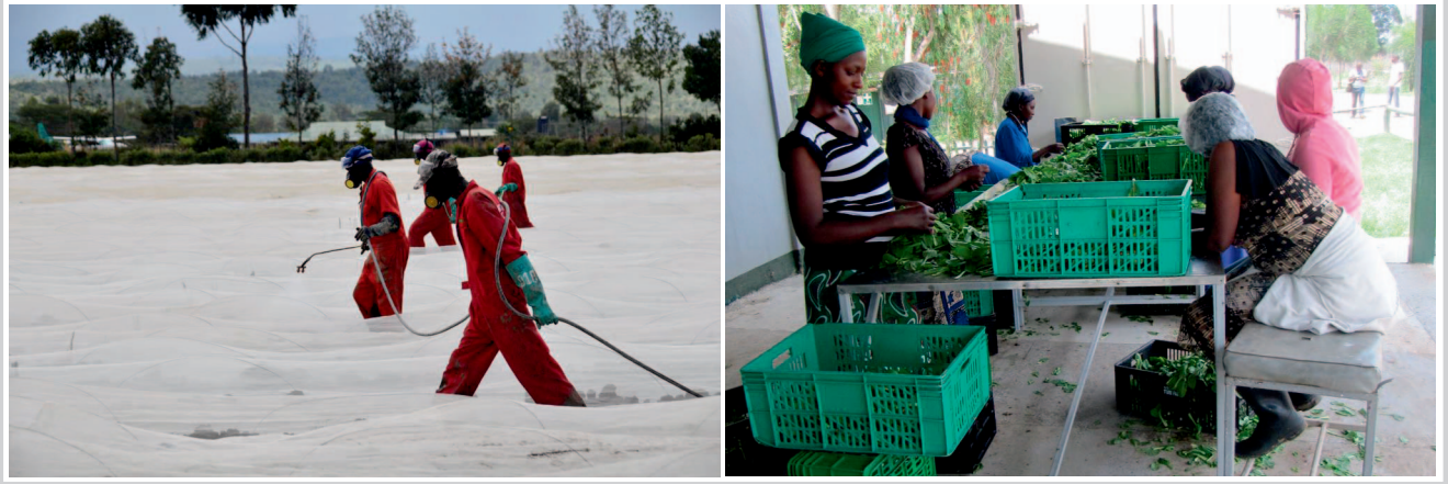
FIGURE 3 Horticultural farm in Nanyuki, Kenya. Left: application of pesticides; right: grading of bok choy.

The produce—runner beans, garden peas, snow peas, green and yellow fine beans, bok choy, basil, chives, green onions, and others—is grown exclusively for export and graded according to a strict process in line with international standards such as GlobalG.A.P., Tesco Nature's Choice, and Marks & Spencer Field to Fork. Produce that fails to meet the grading standards is rejected and disposed of at the horticulture farms or returned to the outgrowers. Vegetables and herbs that are highly perishable are transported in a cold chain and within the shortest possible time after harvest and packing to maintain quality and extend shelf life in the destination markets. Insulated refrigerated trucks are used to transport the products from the farm gate in Laikipia or Meru County to the capital, Nairobi, for holding and forwarding by airfreight to Europe.