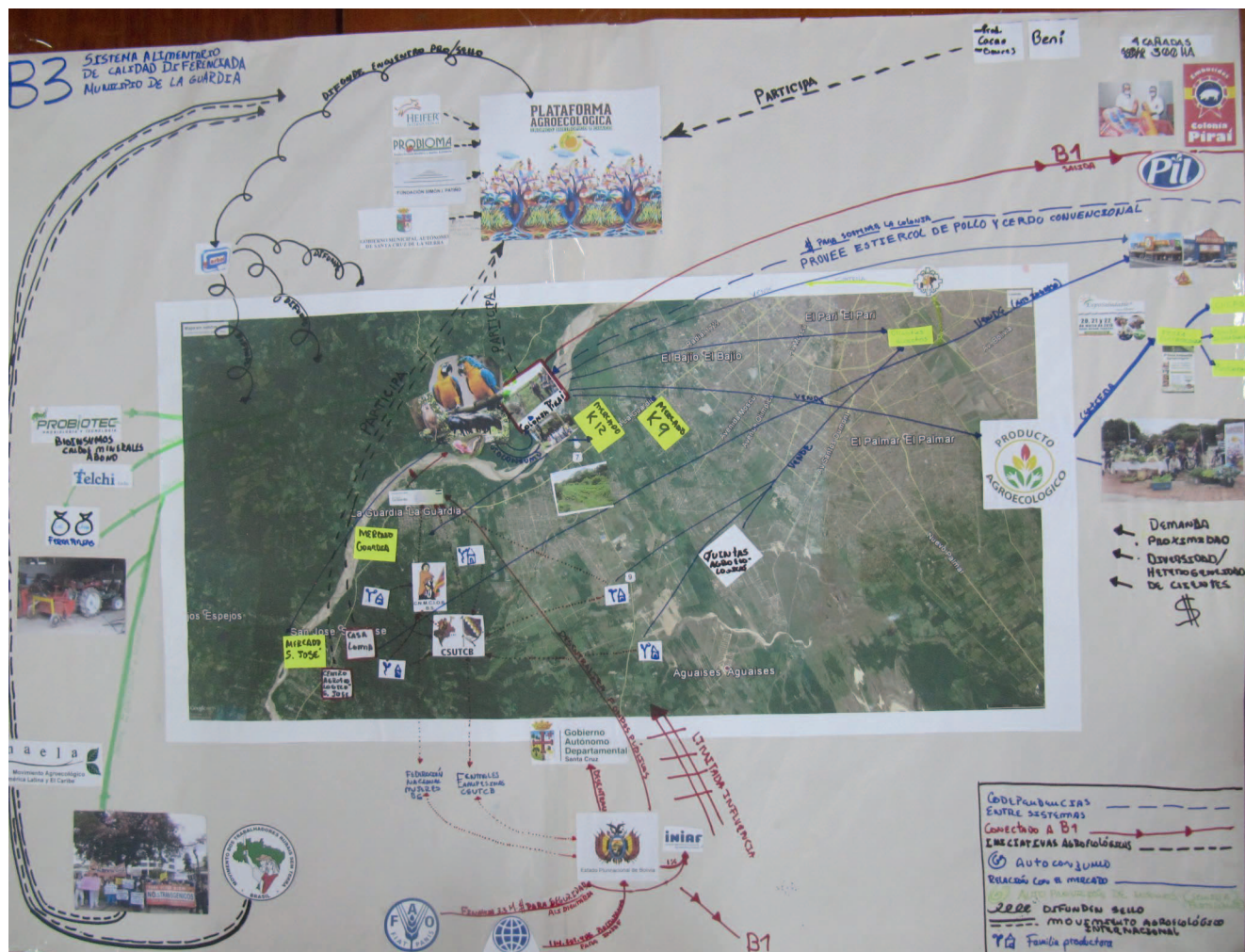
FIGURE 4 Map of an agroecological food system: the Agroecological Platform, a producer–consumer network in Santa Cruz Department, Bolivia, drawn in November 2015. (Map created by the researchers and stakeholders)

habitat diversity, and other resources), besides many links in the operational, political, and information and services subsystems (Kaeser 2018).