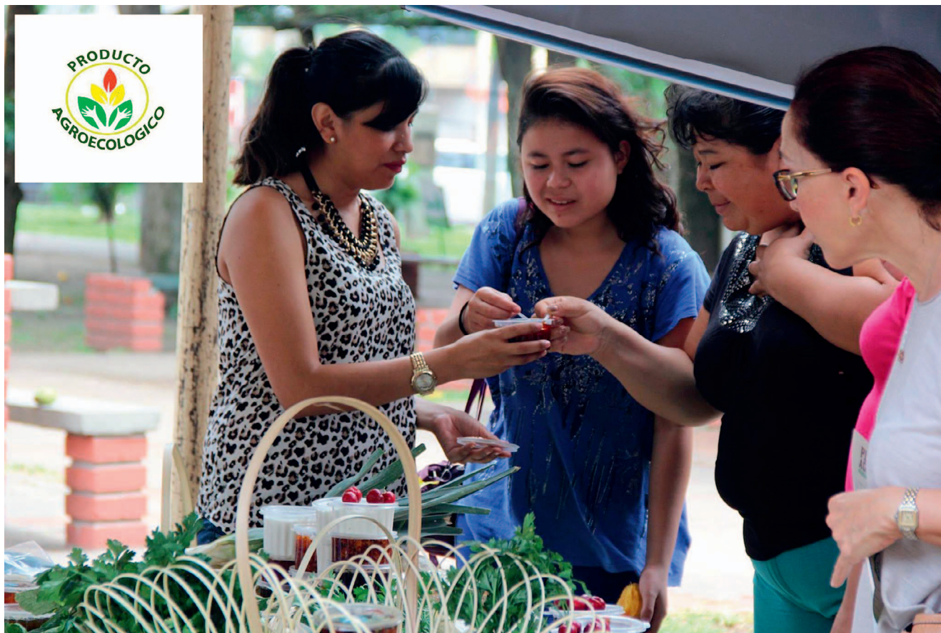
FIGURE 5 Agroecological Platform initiatives in Bolivia. Participants in a farmers market; inset top left: the platform's certification label. (Photo and label by Probioma)

Maintaining and enhancing the diversity of crops and dishes from Bolivia's tropical (lowlands), subtropical (mountains), and Chaco (lowlands and hills) regions is a declared goal of the Agroecological Platform.