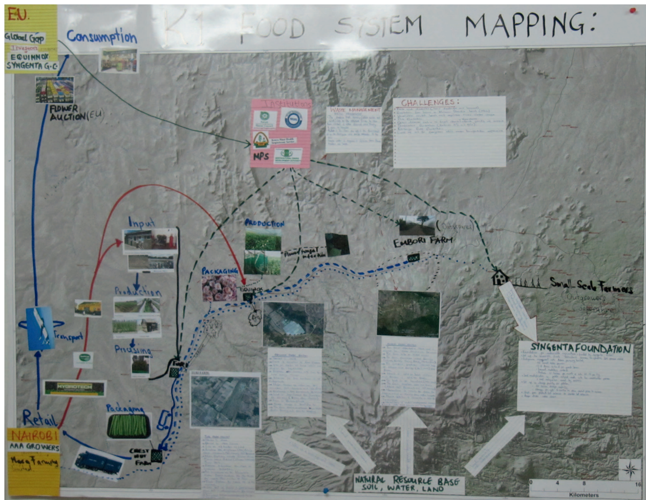
FIGURE 2 Map of an agroindustrial food system: input-intensive horticulture in the Mount Kenya region, drawn in October 2015. Mount Kenya (lower right) is shown as the center of the natural resource base. (Map created by the researchers and stakeholders)

water that the mountain provides. In Bolivia, it showed the close interconnection between the highlands and the lowlands. The diverse habitats and an elevation range of about 1200 m enable production of various foods, which are traded and consumed along the highland–lowland continuum. The area has high agrobiodiversity—from Andean root crops to tropical fruits—and a diversity of traditional dishes and nutritional knowledge, which are linked to the habitats and cultures influenced by the migration history.