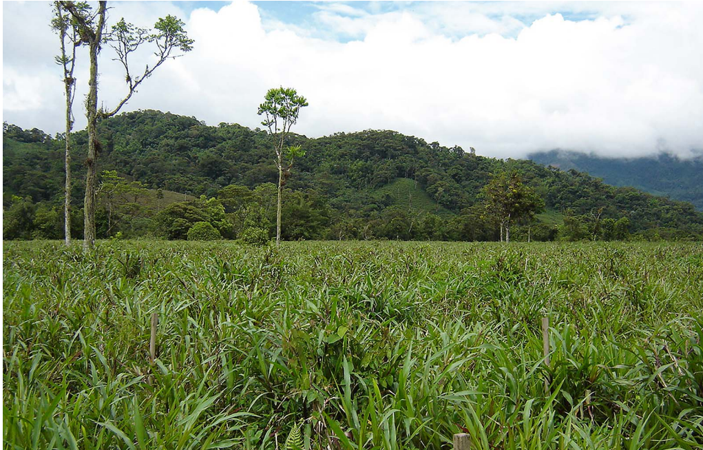
FIGURE 4 Lowland pastures and upland forests.

populations to unite around a program of sustainable development. Conflict between these actors has marked the governance of land use in these zones, and it has varied with proximity to the mines (Vela-Almeida 2018). The landscape has become territorialized, with distinct zones of land use, including sacrifice zones close to the mines.