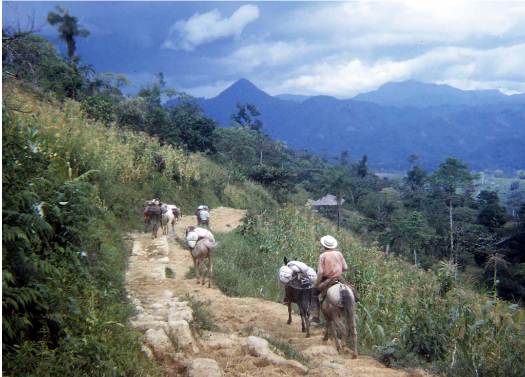
FIGURE 3 Mestizo colonists on the trail into Amazon lowlands, 1960s.

lands to the west. An agroecological rationale underlaid this scheme. The Salesians had begun promoting the adoption of cattle ranching among the Shuar as a device for strengthening their claims to land through the conversion of forests into pastures, but Shuar livelihoods remained focused, at least initially, on producing root crops like cassava ( Manihot esculenta ) and fruits like plantains ( Musa sp) for household consumption. The growth of these plants slows at elevations above 1000 masl, so the Shuar preferred to establish their gardens and centros at lower elevations. Mestizo colonists followed a somewhat different calculus, given their focus on converting forests into pasture for cattle (Salazar 1986). While they did not want to convert sharply sloped land from forests into pastures for fear that the steep slopes would endanger grazing cattle, they regarded less sloped, higher-elevation lands as desirable for raising cattle.