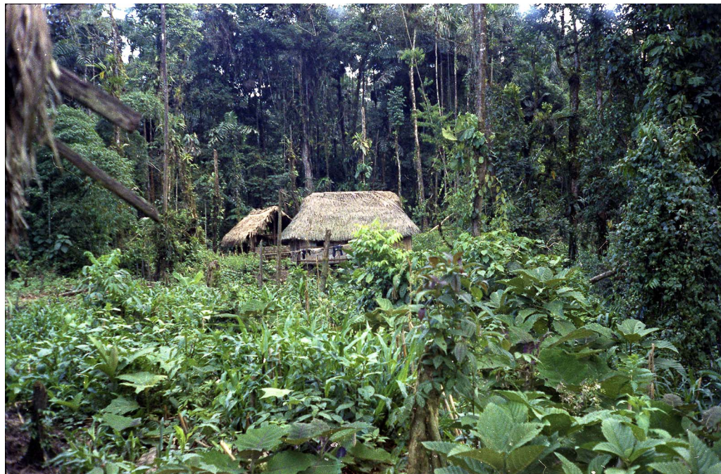
FIGURE 2 A Shuar homestead.

The state had little presence in the Amazon region at the beginning of the 20th century. The national government, headquartered in Quito, had several small garrisons on eastward-flowing tributaries of the Amazon river. A few settlements of mestizos , with no more than several hundred inhabitants, existed at the base of the Andes. Peruvian traders from downstream centers, like Iquitos, made occasional visits to these settlements. The Peruvian presence provoked concern among Ecuadorian elites. In 1889, to strengthen Ecuador's claim to these lands, the government authorized Salesian priests, an order of Catholic missionaries, to evangelize among the region's Amerindians (Bottasso 2011).