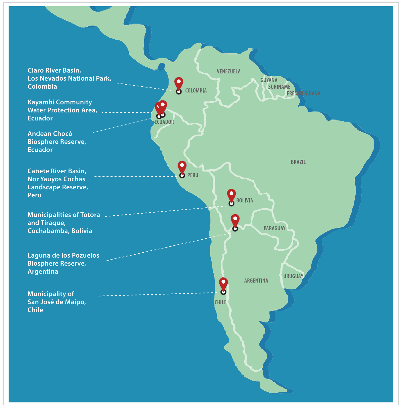
FIGURE 2 Map of case studies for the sociopolitical analysis of climate change adaptation policies in the Andes.