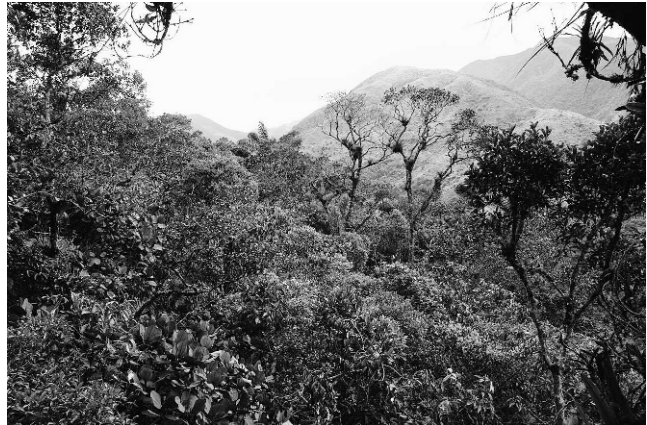
FIGURE 2 Loja, Ecuador: a typical example of an Andean montane forest.

to account for the potential impacts of climate change (Vuille et al 2008), developments must go hand in hand with the implementation of measures and mechanisms that conserve and protect the natural ecosystem. Sustainable development measures, conservation, and rehabilitation require, among other things, knowledge about the hydrology of natural and altered ecosystems and about relationships between the water system and anthropogenic and natural impacts. Given the importance of good understanding of the hydrology, the present article describes the state of the art of Andean páramos and forests (Figures 1, 2, respectively), based on a review of international literature, primarily related to Ecuador. The review is further used as a basis for the formulation of recommendations to enhance investigation of the hydrology of Andean wet ecosystems.