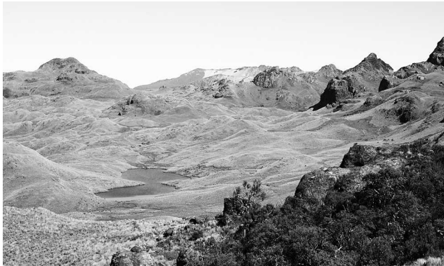
FIGURE 1 El Cajas National Park, Ecuador: a view of the páramo .

Andean region becomes increasingly altered that attention is converging on this high-altitude water supply system (Buytaert et al 2006).