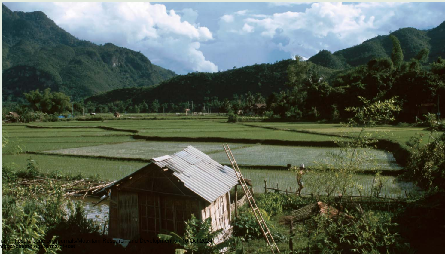
FIGURE 1 Forest resources are an important part of rural people's livelihoods: natural forests in the Pu Luong limestone range, northern Viet Nam.

Preserving valuable multifunctional forest ecosystems is a primary concern of the Vietnamese government. The perception that this can only be achieved through decentralized multi-stakeholder forest management that involves the local population in the management of resources (and not in a top-down manner) prevails among decision-makers.