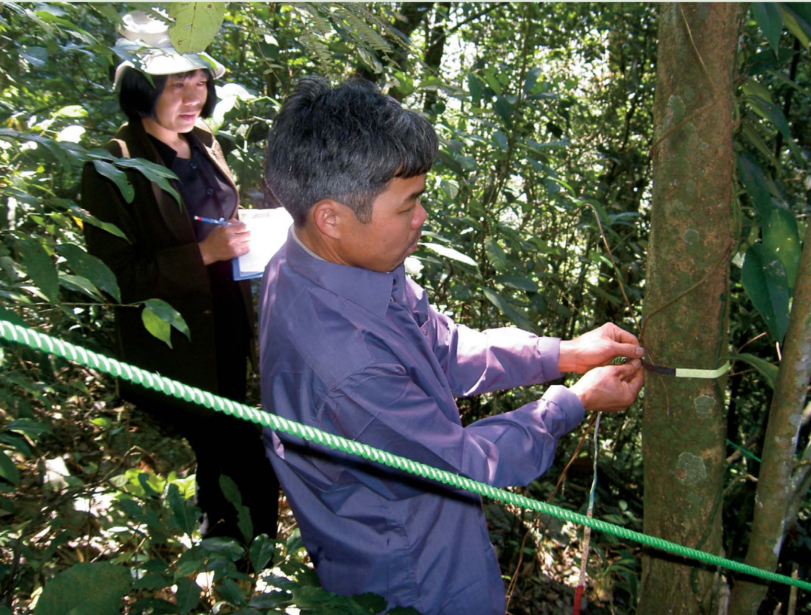
FIGURE 4 Collaboration as a key element: a villager and district forestry staff member carry out a joint forest resource assessment as a basis for defining sustainable forest management options.