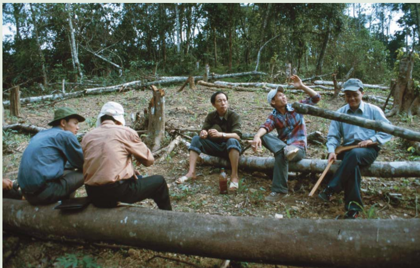
FIGURE 5 Fieldwork is an integral part of the training modules for hands-on experience, using methods learned in the field. (Photo by Patrick Sieber, 2005)

substantial reduction of rural poverty in highland areas will make it possible to ensure the long-term protection of Vietnamese mountain forests and to safeguard their multiple functions, which provide services and benefits that range far beyond the local level.