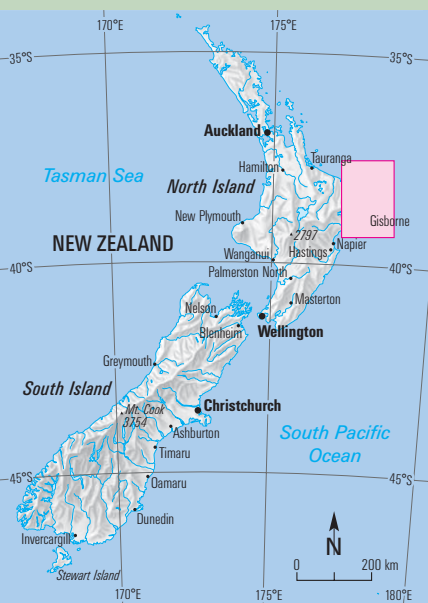
FIGURE 1 Map of the East Cape of NZ. (Map by Andreas Brodbeck)

worked with indigenous Māori landowners in a rural area of NZ to implement a “carbon farming” project—a management system that encourages reforestation and generates marketable offsets for greenhouse gas emissions under the Kyoto Protocol. Our experience in establishing a carbon sequestration project sheds light on the factors affecting uptake and project success for other groups seeking to utilize these markets as a tool for sustainable development.