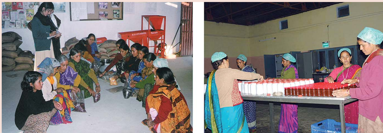
FIGURE 3 Left: members of the Rawain Women's Cooperative Federation providing advanced training on grading, packing, and processing to self-help groups. Right: members of the RWCF packing apple jam and amla pickles for marketing.

tems. Women of different SHGs were willing to take up entrepreneurship but initially were not confident of their ability to do so. An NGO working in this area, the Himalayan Action Research Centre (HARC), played an important role by providing institutional support through different programs such as creation of self-help groups (SHGs). The Rawain Women's Cooperative Federation (RWCF) was formed by HARC in the late 1990s.