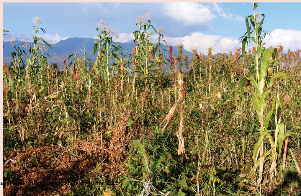
FIGURE 1 A field of monsoon crops in the study area (Baranaza), where 7 to 8 traditional crops grow simultaneously in one field.

This tradition of arduous work has inculcated the wisdom to rationally use, promote, and conserve the ecological system and biodiversity. Consequently, women have internalized the fact that conservation of the environment is a prerequisite for food security. From centuries of experience they have learned the art of