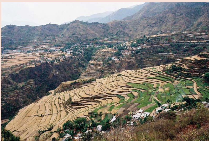
FIGURE 2 Villages in the study area (1800 m) known for traditional grain crops and pulses.

To examine the ongoing process of transformation from subsistence to market-oriented agriculture in mountain areas, specifically among women, a sample of 12 villages located between 1500–2000 m in the Yamuna valley, in the Nagaun and