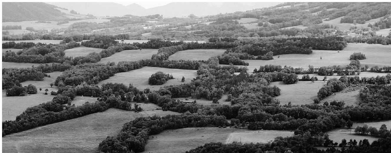
FIGURE 2 A well-structured landscape offers a habitat for a variety of species.

outset of the local and regional planning process (municipalities, regional authorities).