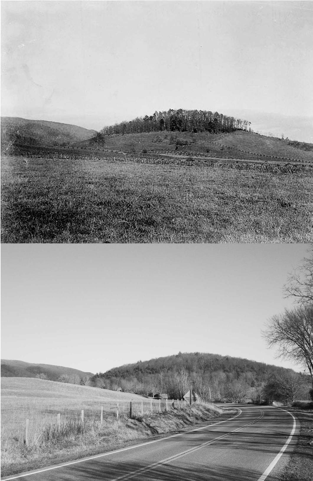
FIGURE 1 Repeat photographs from Walker's Creek near White Gate, Virginia. The top photograph was taken in 1880 and the bottom photograph in 2008. The hill in the background represents the conversion of higher elevation agricultural lands to forest.